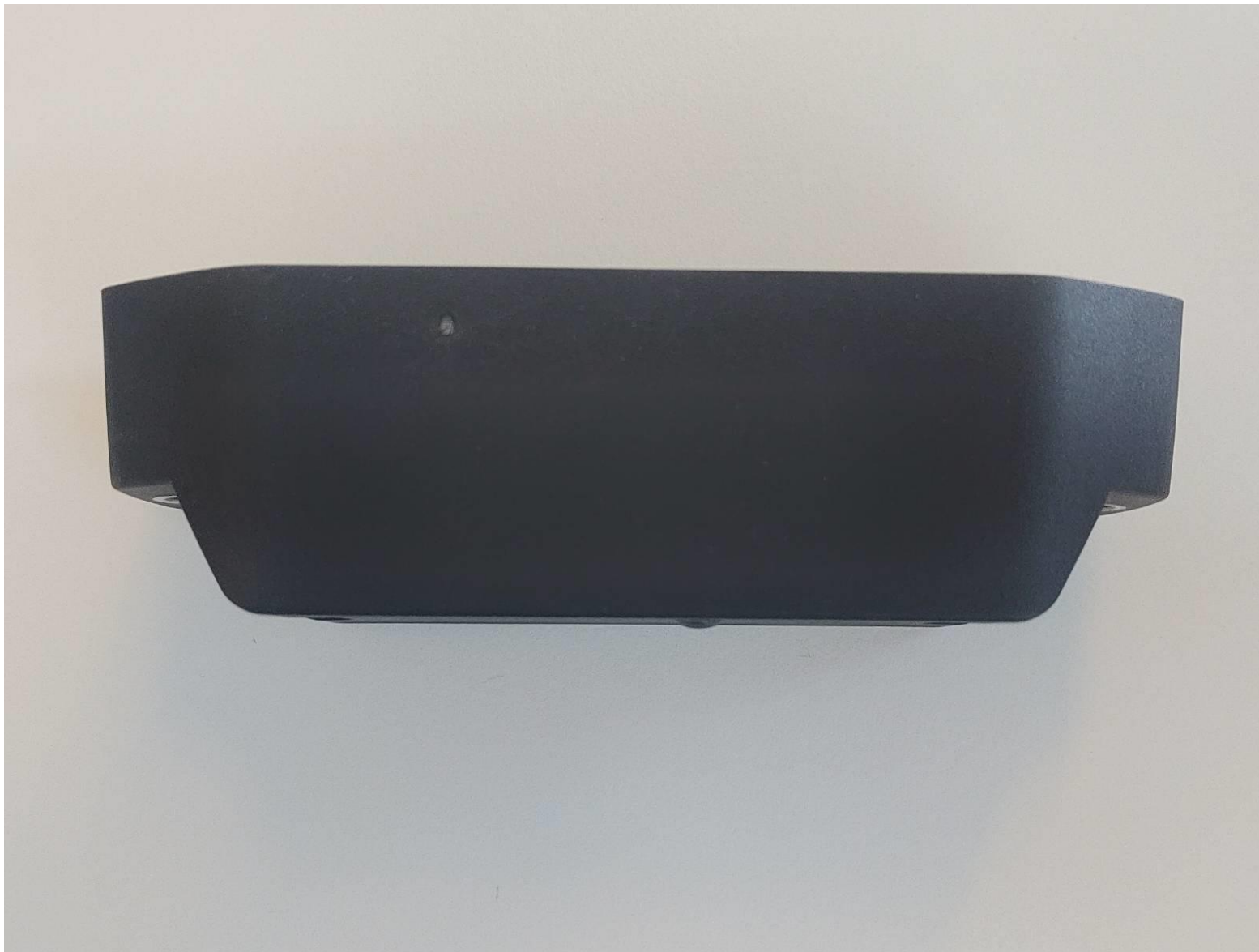
Device side 3