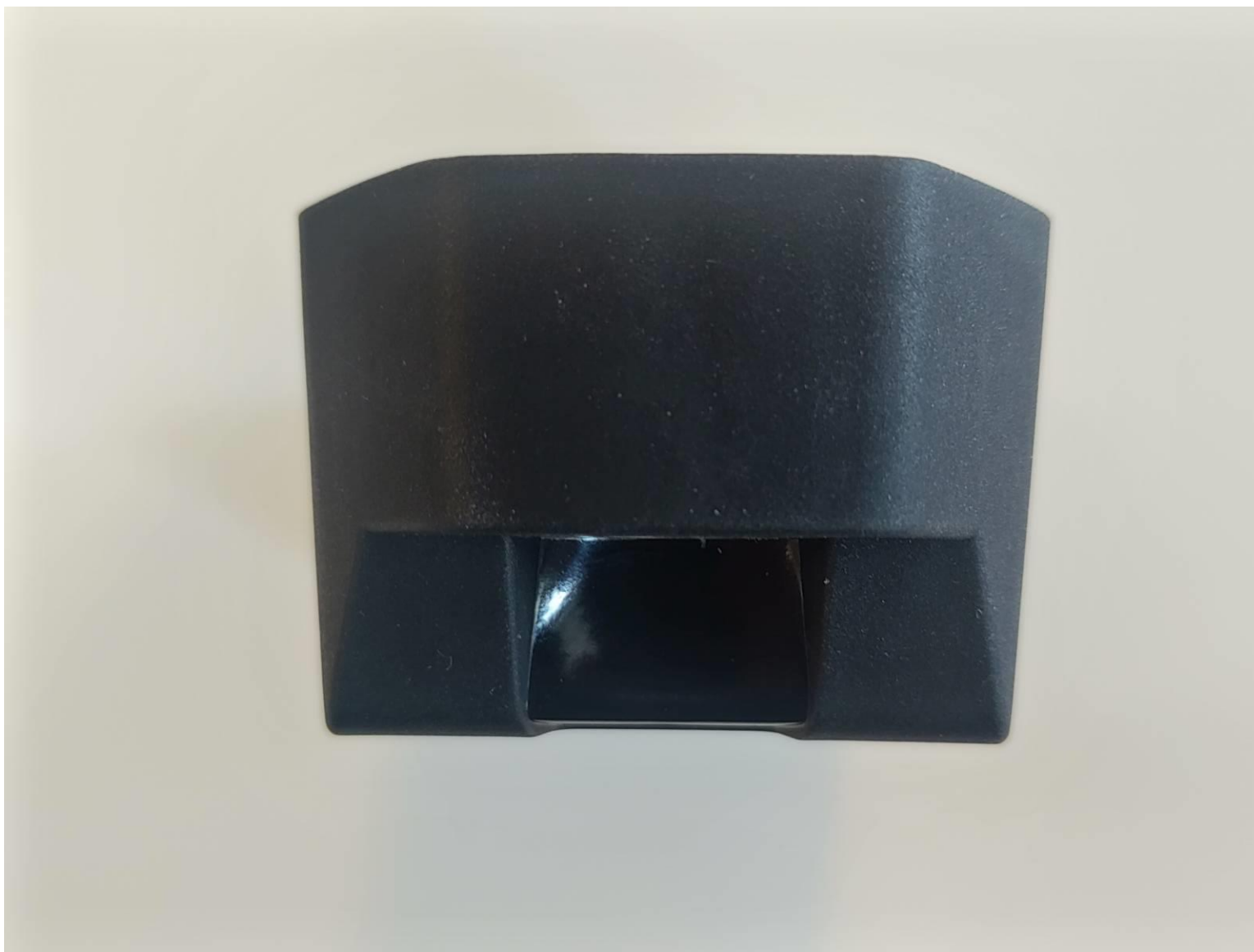
Device side 4