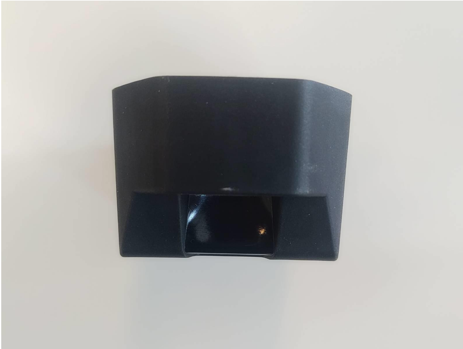
Device side 2