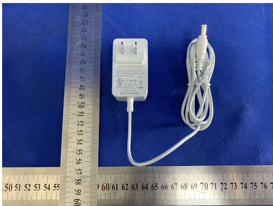
View of Product10