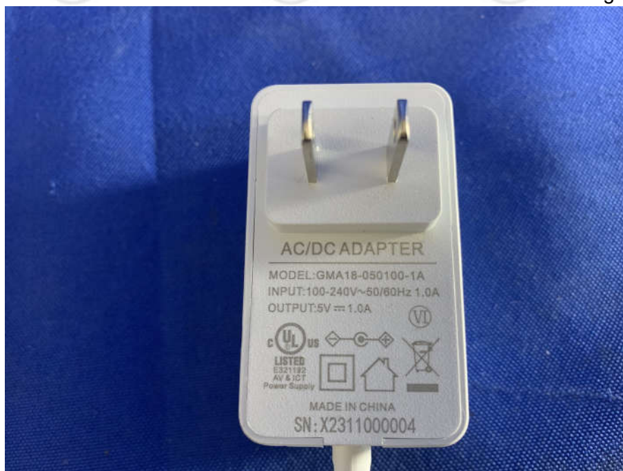
View of Product-11