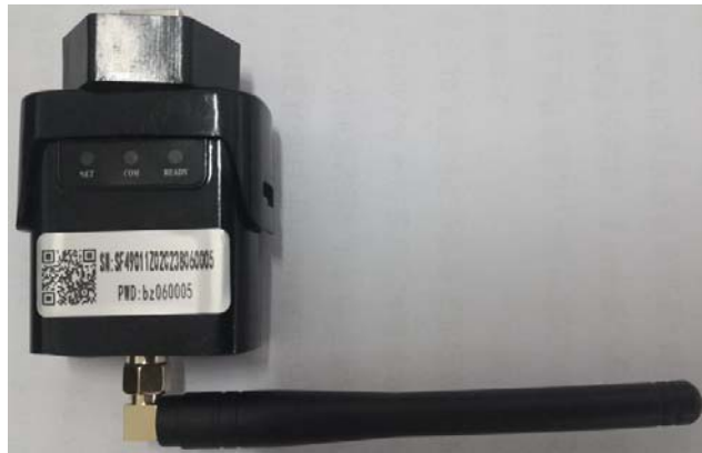
Figure 1 BDH200-WU Frontal view of the data acquisition terminal