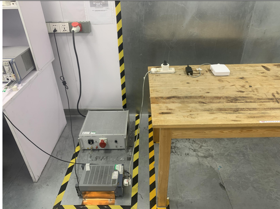
Emissions in restricted frequency bands (below 1GHz)