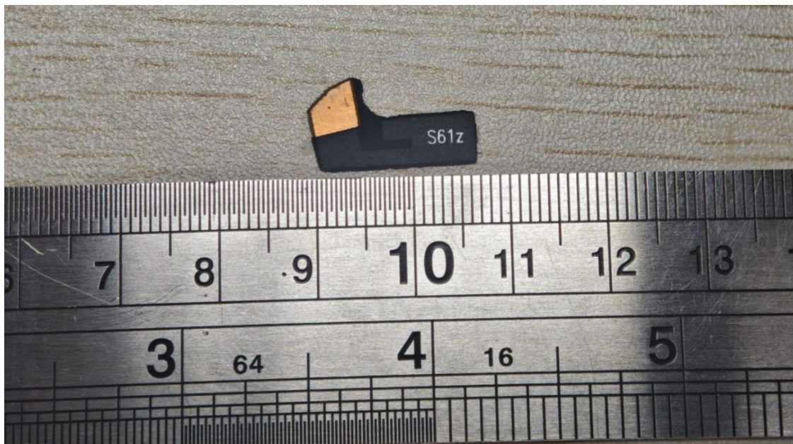
Antenna Bottom View [With Ruler]