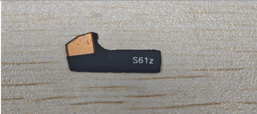
Antenna Top View