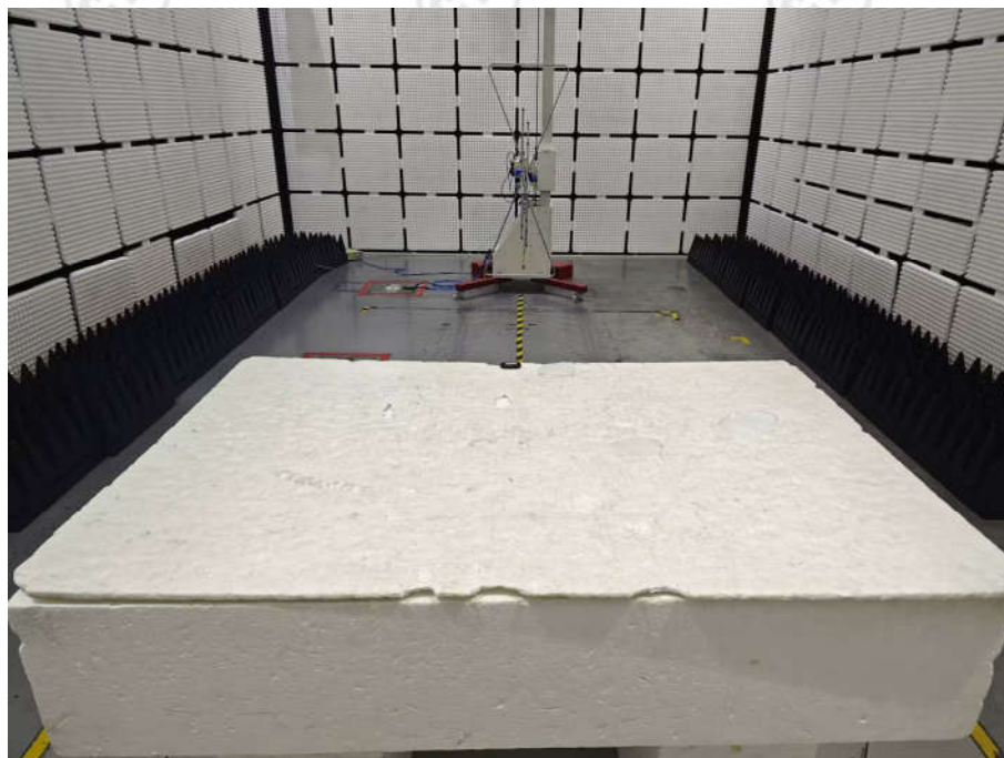
Radiated emission Test Setup-1 (30MHz~1GHz)