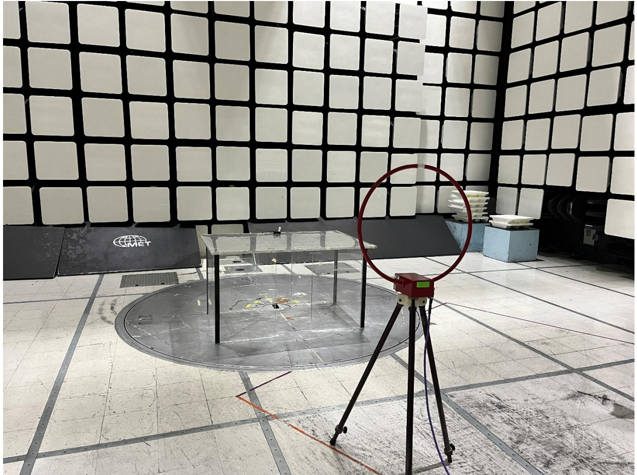
Radiated Emissions Below 30MHz