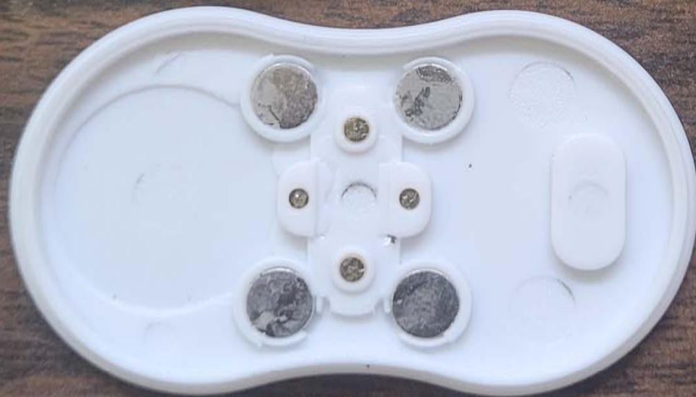
Inside View of the EUT