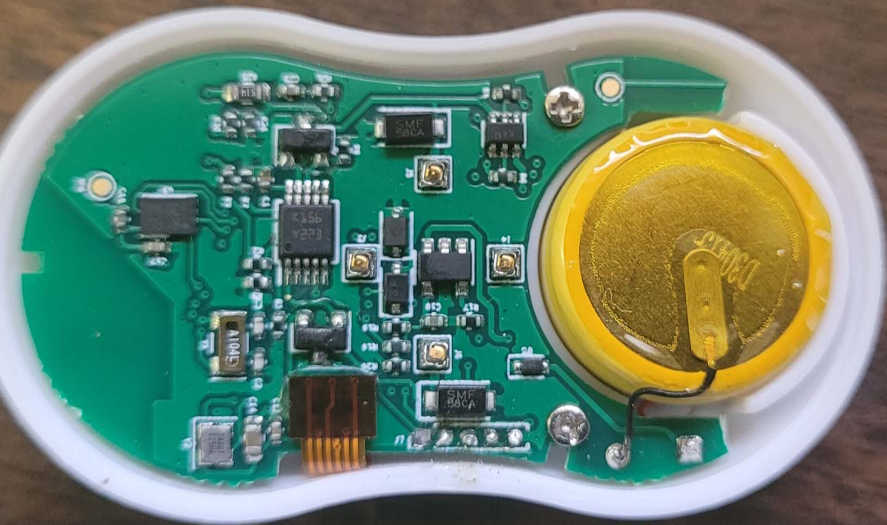
Top View of the PCB