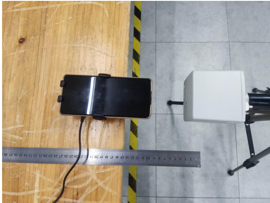
Test Position A-15cm from the edge of EUT to the geometric center of the probe