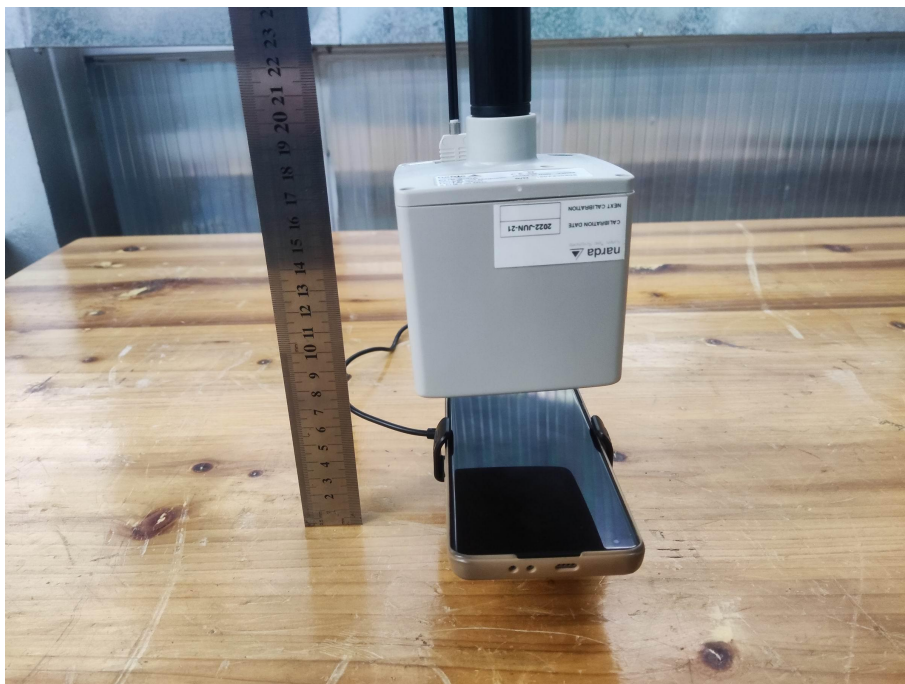
Test Position E-20cm from the edge of EUT to the geometric center of the probe