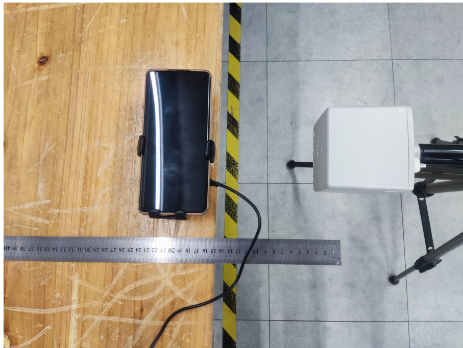
Test Position B-15cm from the edge of EUT to the geometric center of the probe