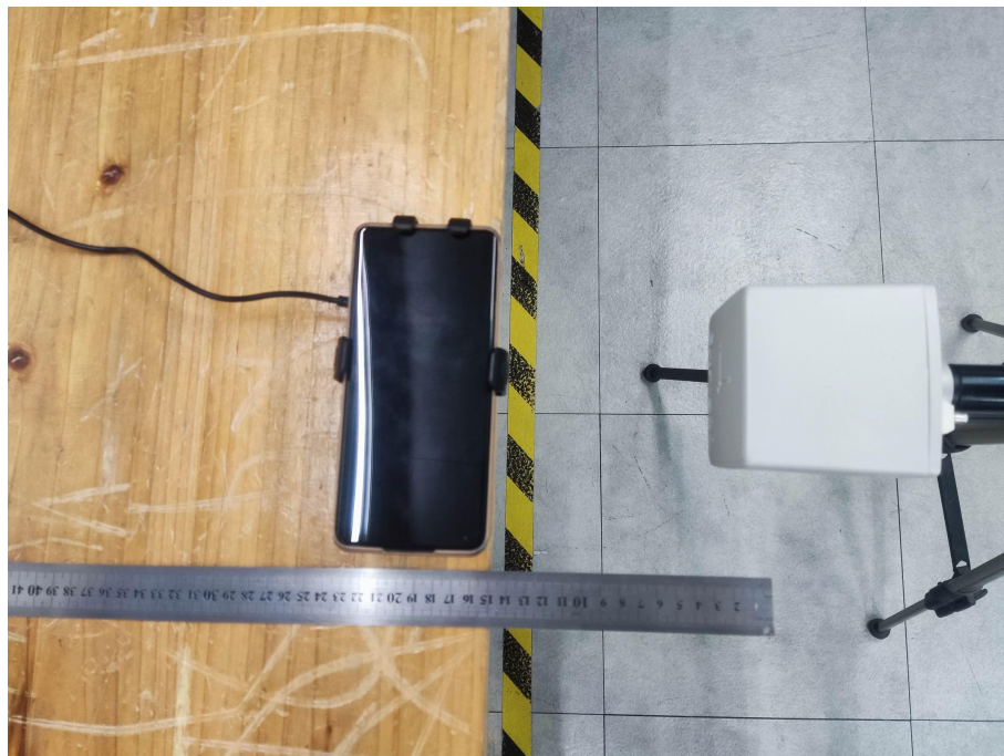
Test Position D-15cm from the edge of EUT to the geometric center of the probe