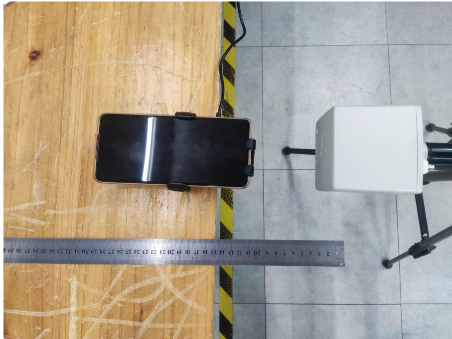
Test Position C-15cm from the edge of EUT to the geometric center of the probe