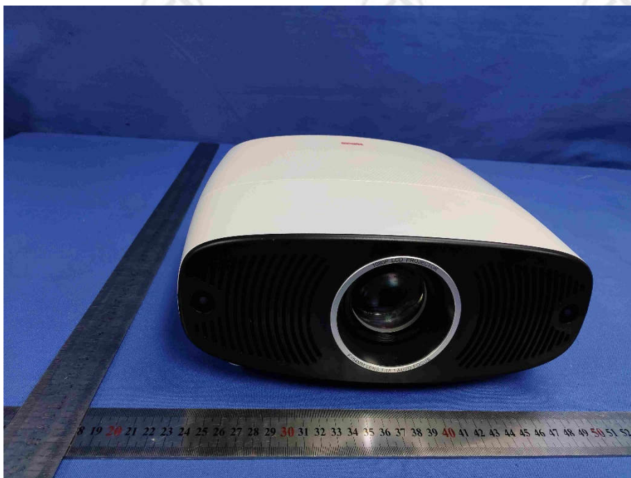
View Of Product-05