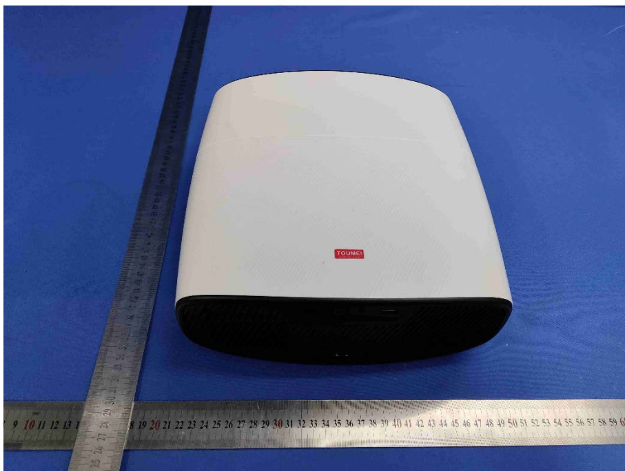
View Of Product-02