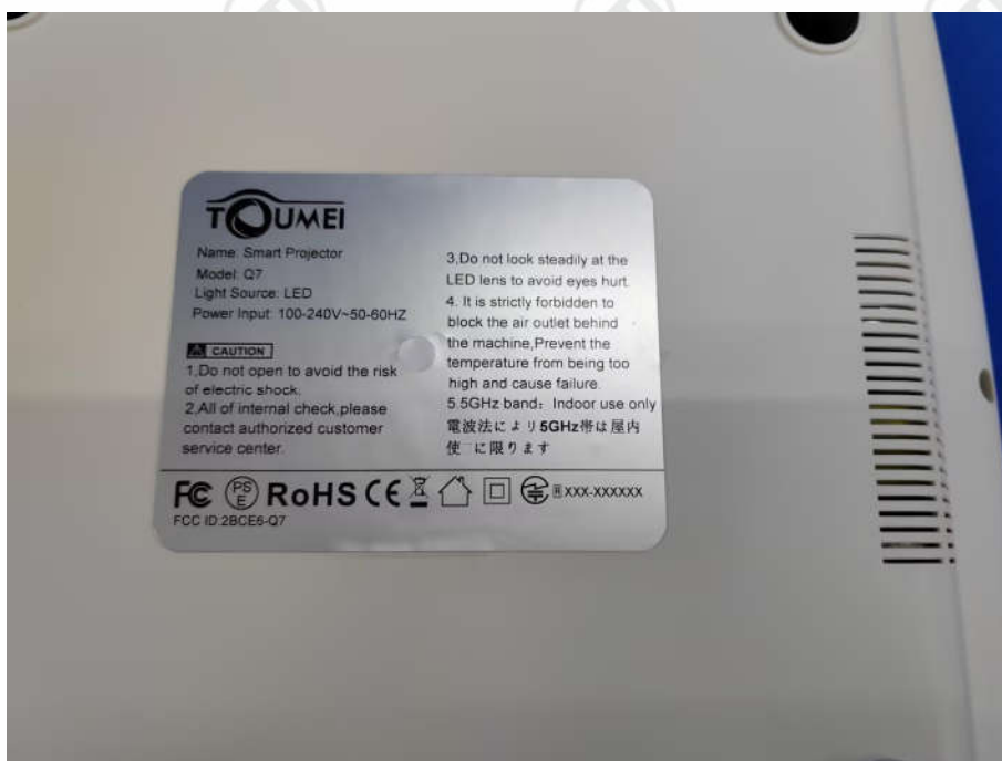
View Of Product-08