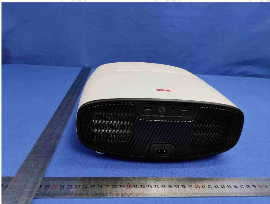
View Of Product-03