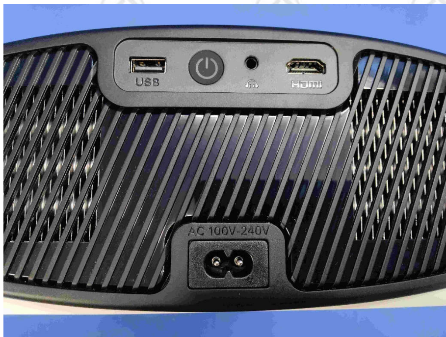
View Of Product-09