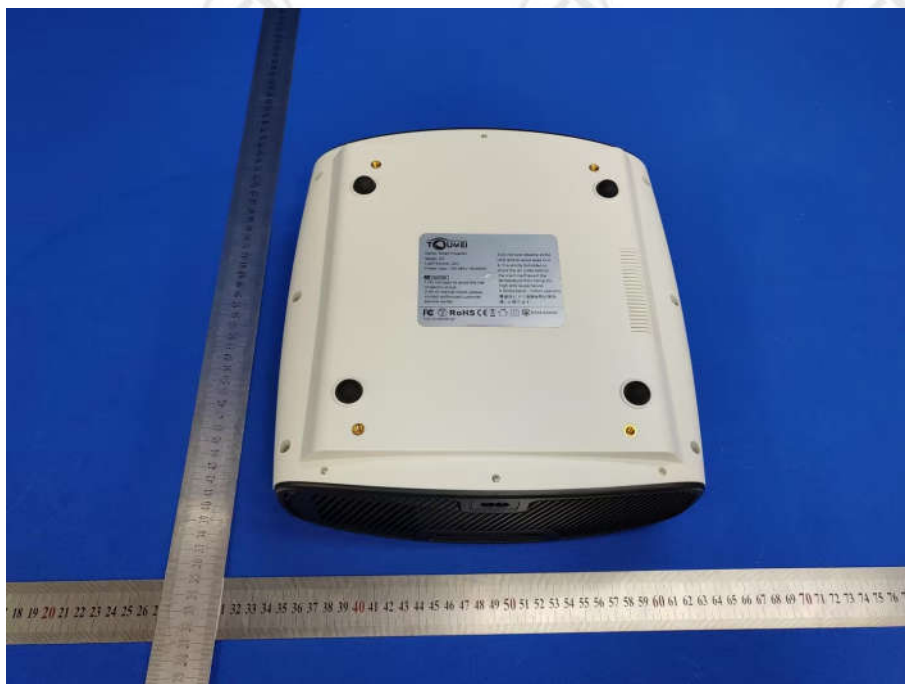
View Of Product-07