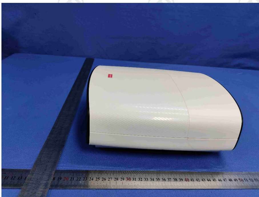
View Of Product-04