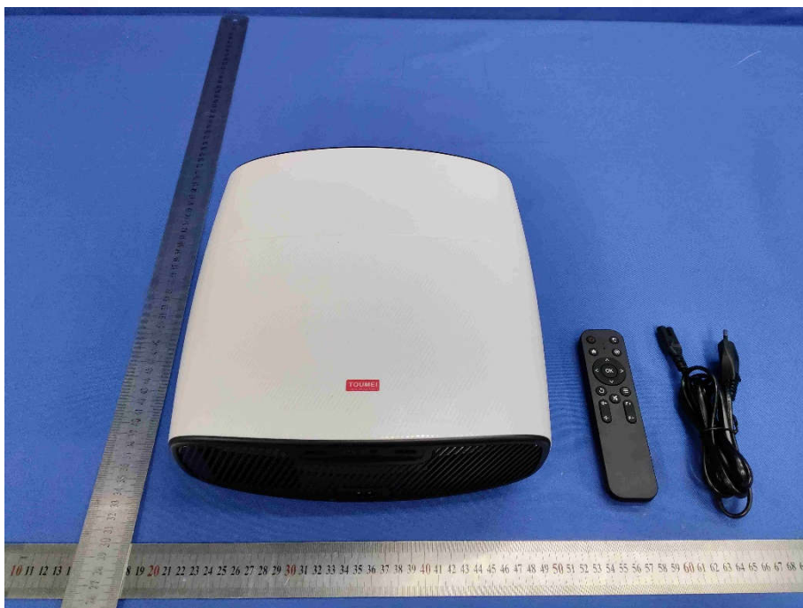
View Of Product-01