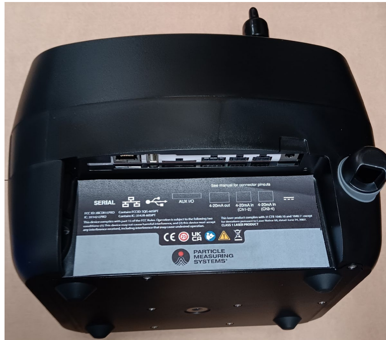
Figure 2 Label Placement – Rear of Unit