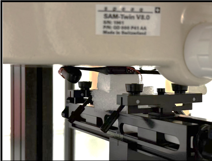
Inside of Earphone with 0 cm Gap