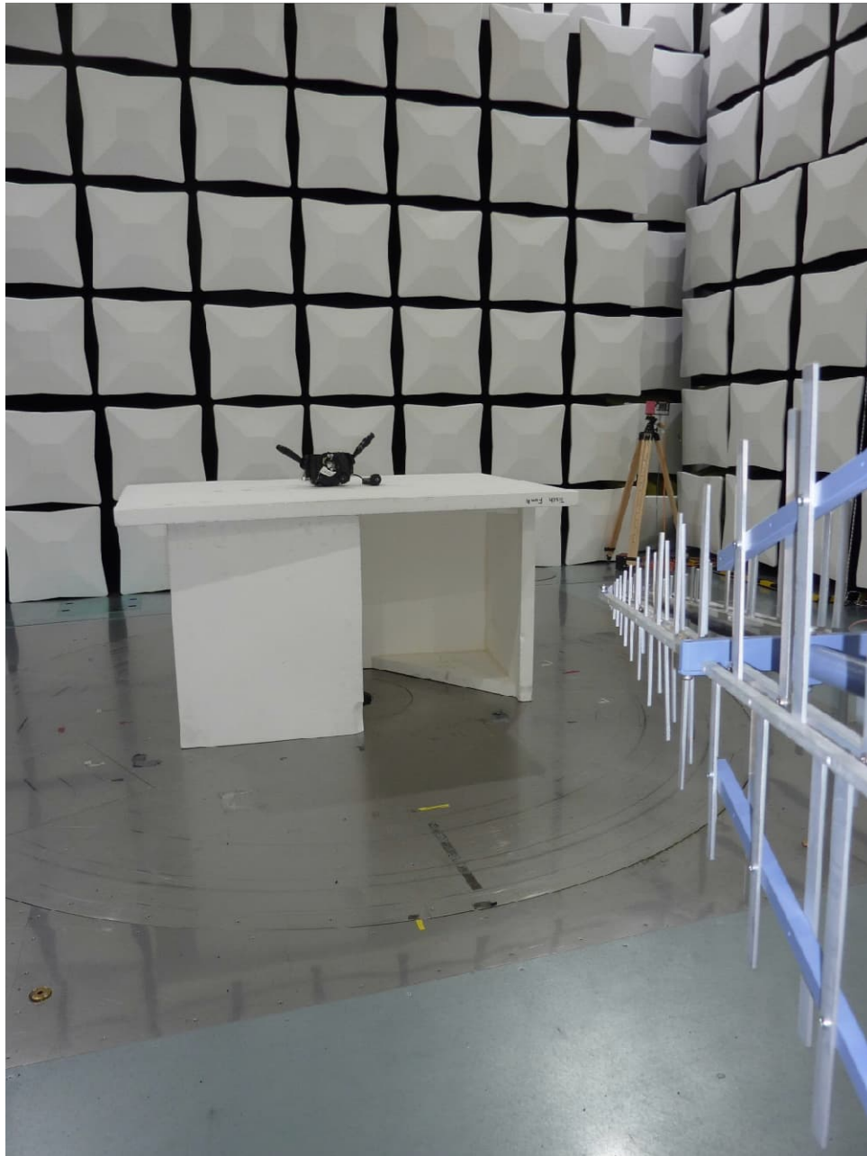
Test setup semi-anechoic chamber M276; Preliminary and final measurement 30 MHz – 1 GHz