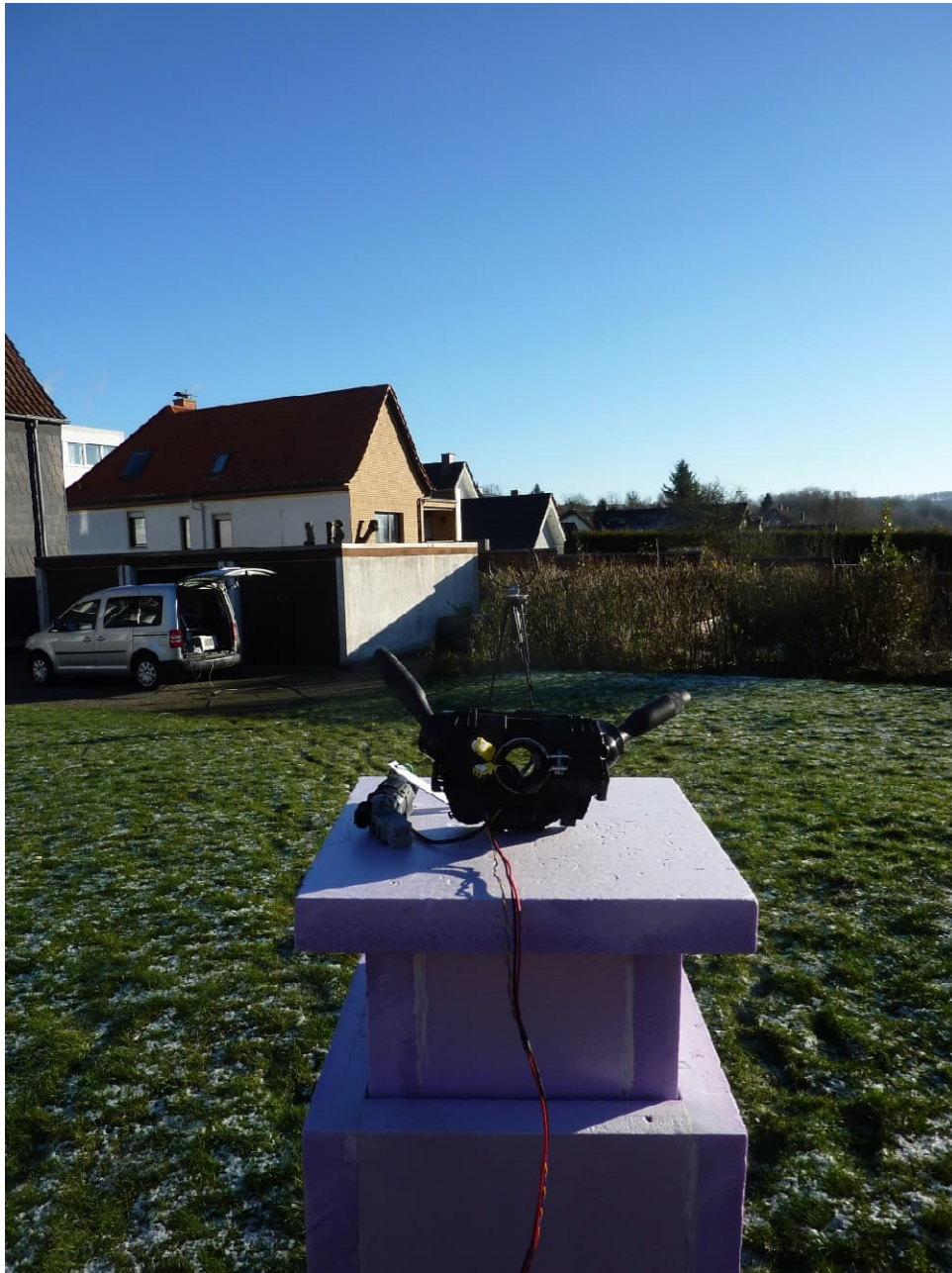
Test setup OATS; Final measurement 9 kHz to 30 MHz