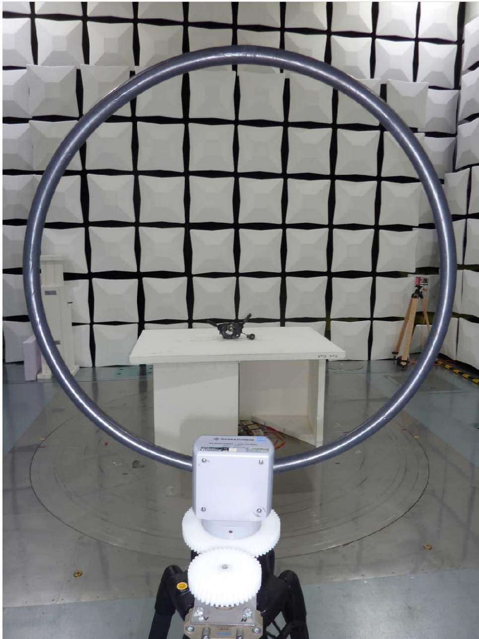
Test setup semi-anechoic chamber M276; Preliminary measurement 9 kHz to 30 MHz