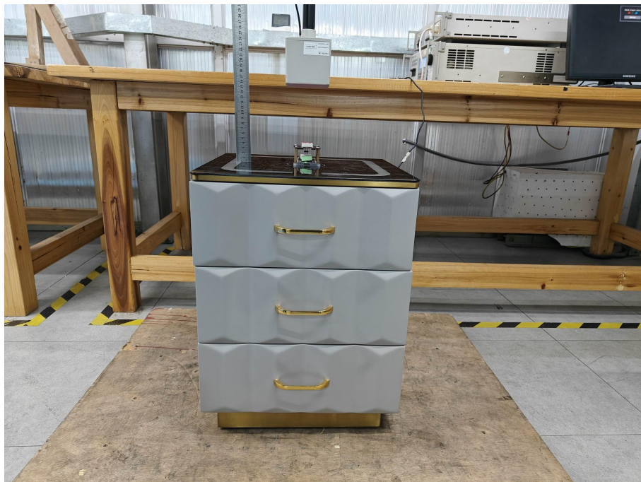
Test Position E-20cm from the edge of EUT to the geometric center of the probe