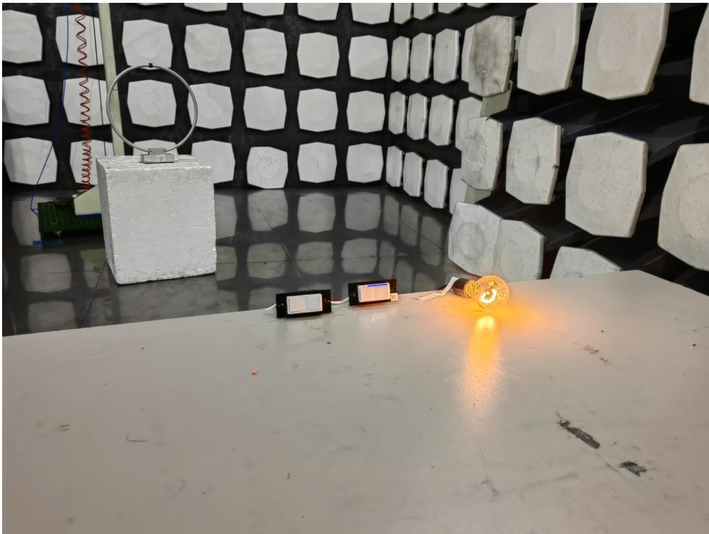
9kHz to 30MHz Radiated Spurious Emissions