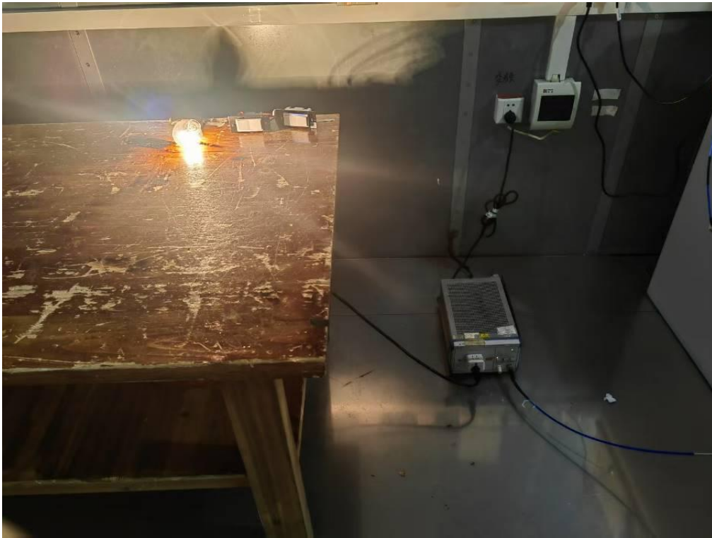
Conducted Emissions at Mains Terminals 150 kHz to 30 MHz