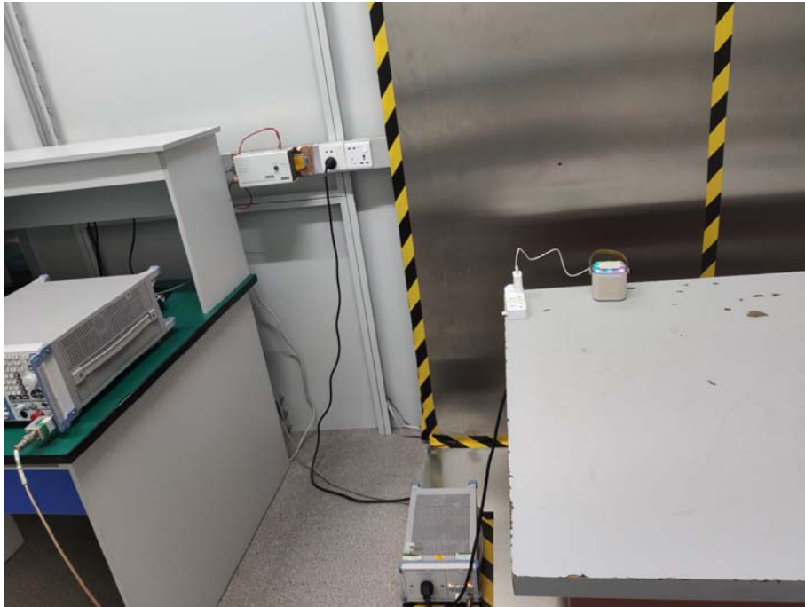
RF Conducted Emission