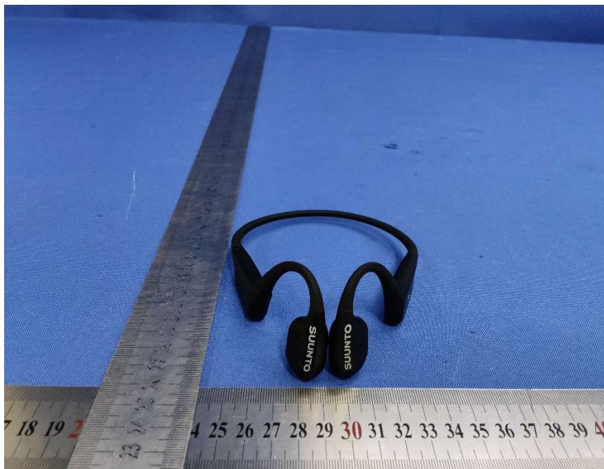
View of Product-03