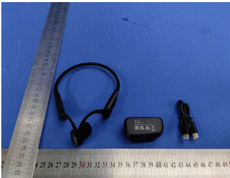
View of Product-01