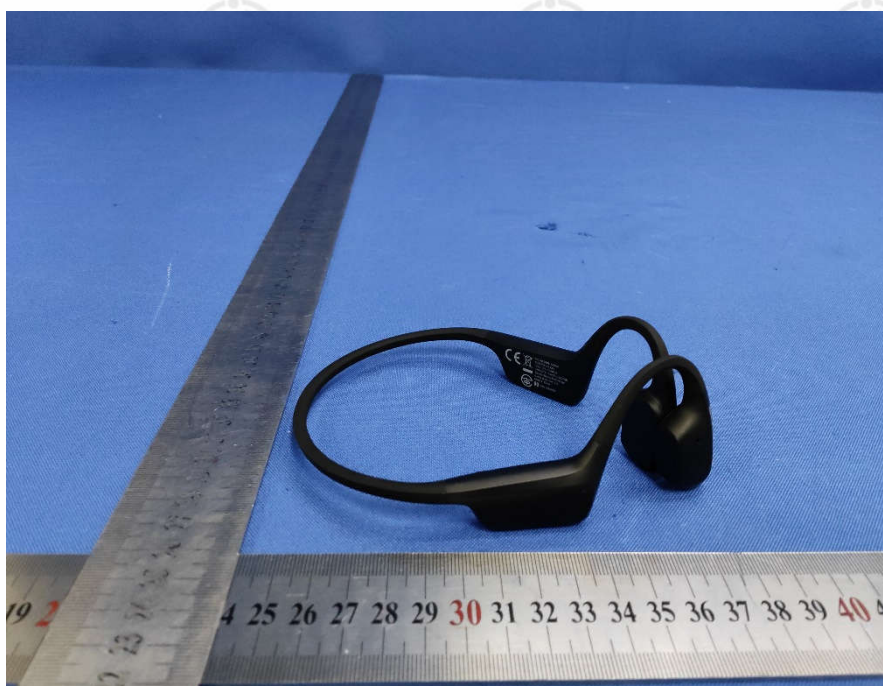
View of Product-06