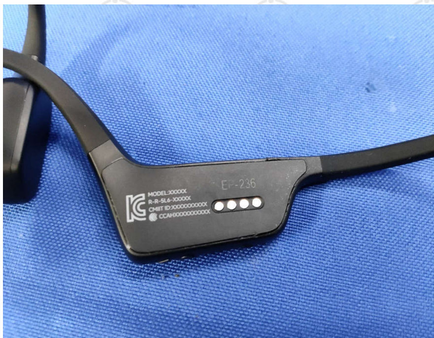
View of Product-08