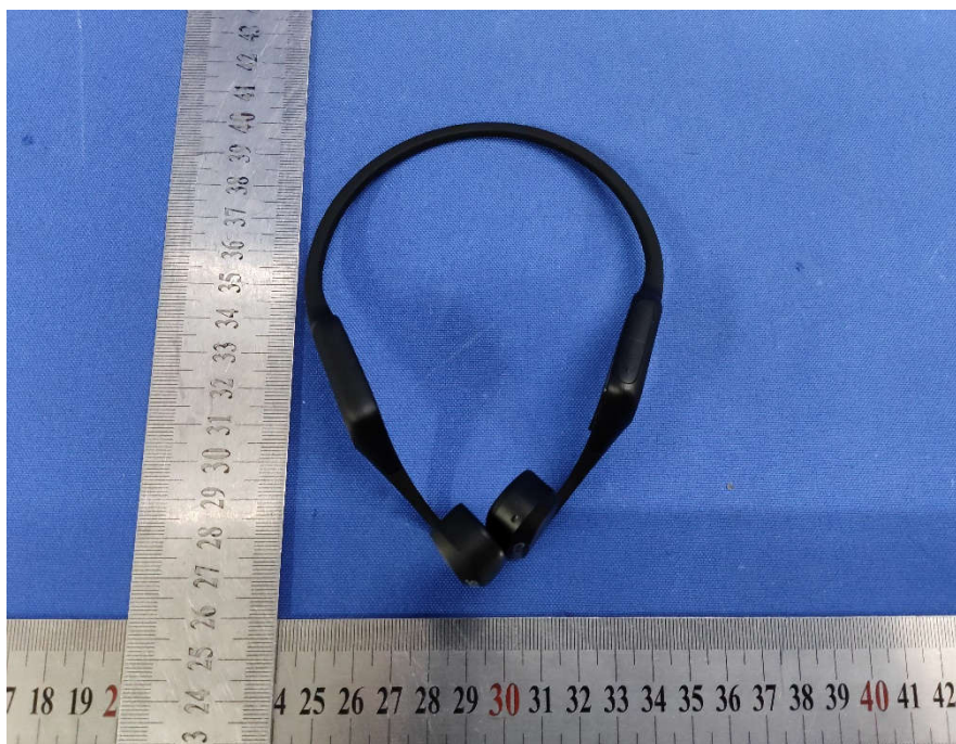
View of Product-07