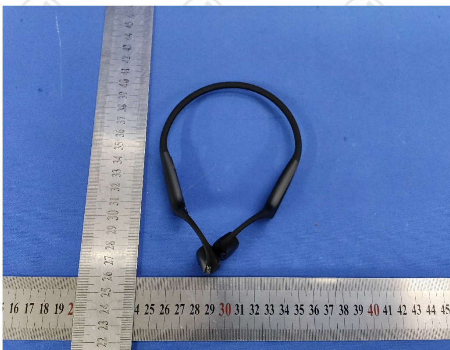
View of Product-02