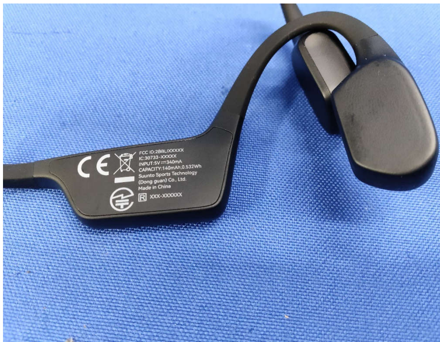
View of Product-09