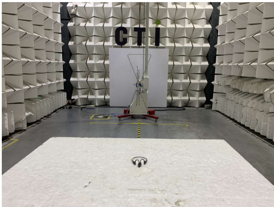
Radiated spurious emission Test Setup-1 (Below 1GHz)