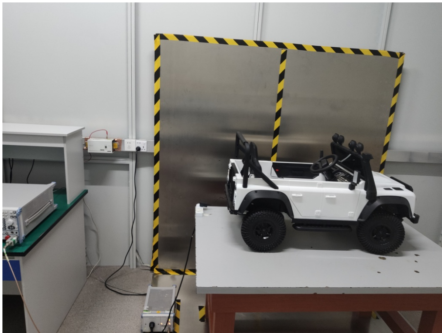
RF Conducted Emission