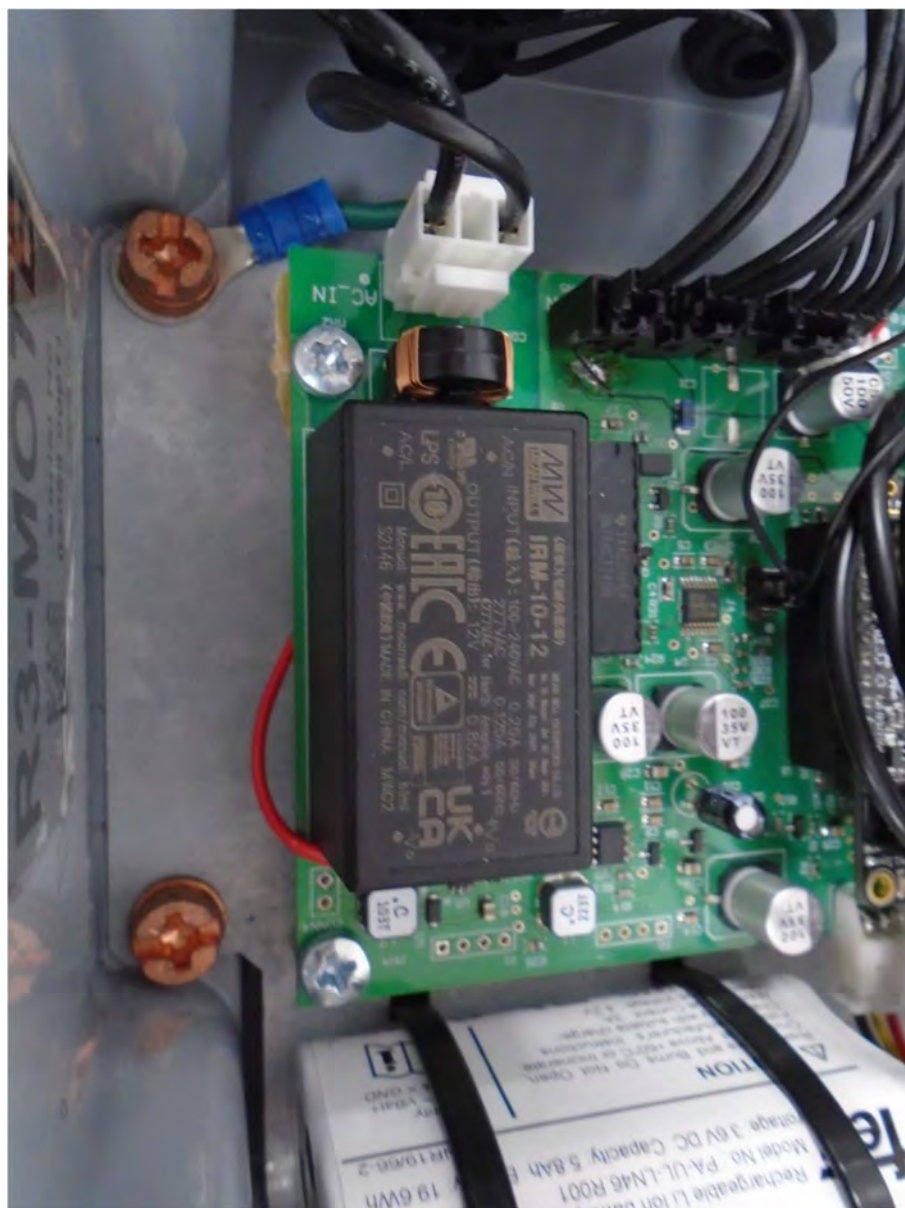
MEANWELL IRM PSU