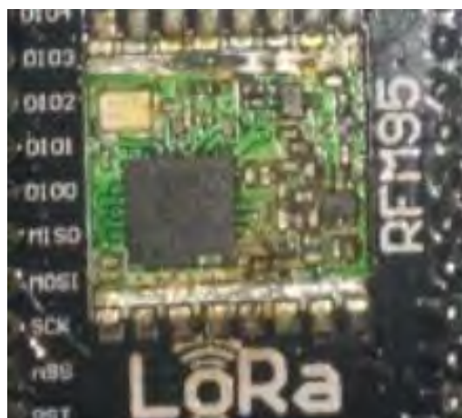
Module top view – shielding removed