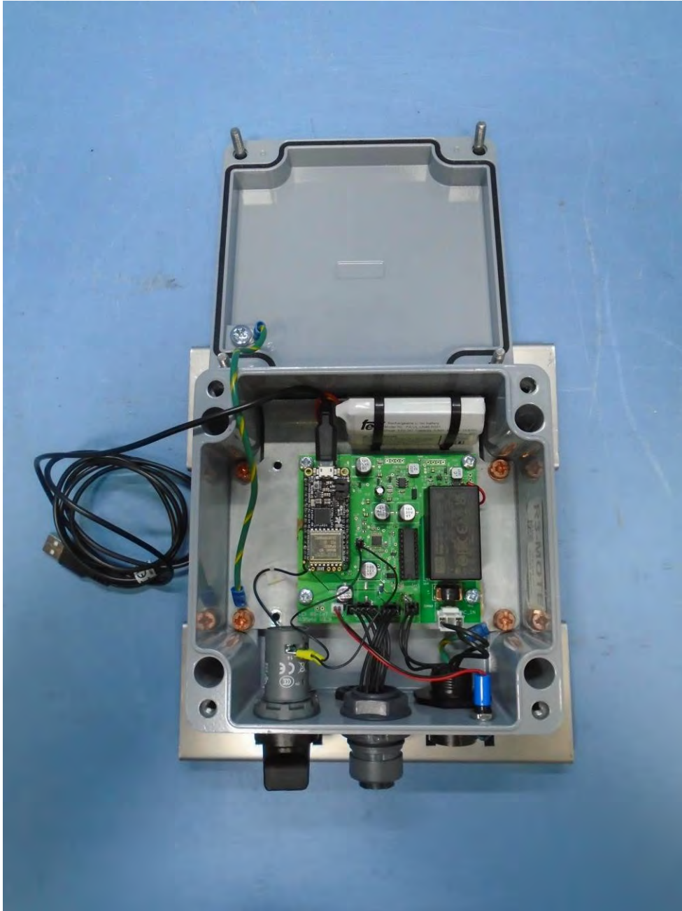
INTERNAL LID & BASE