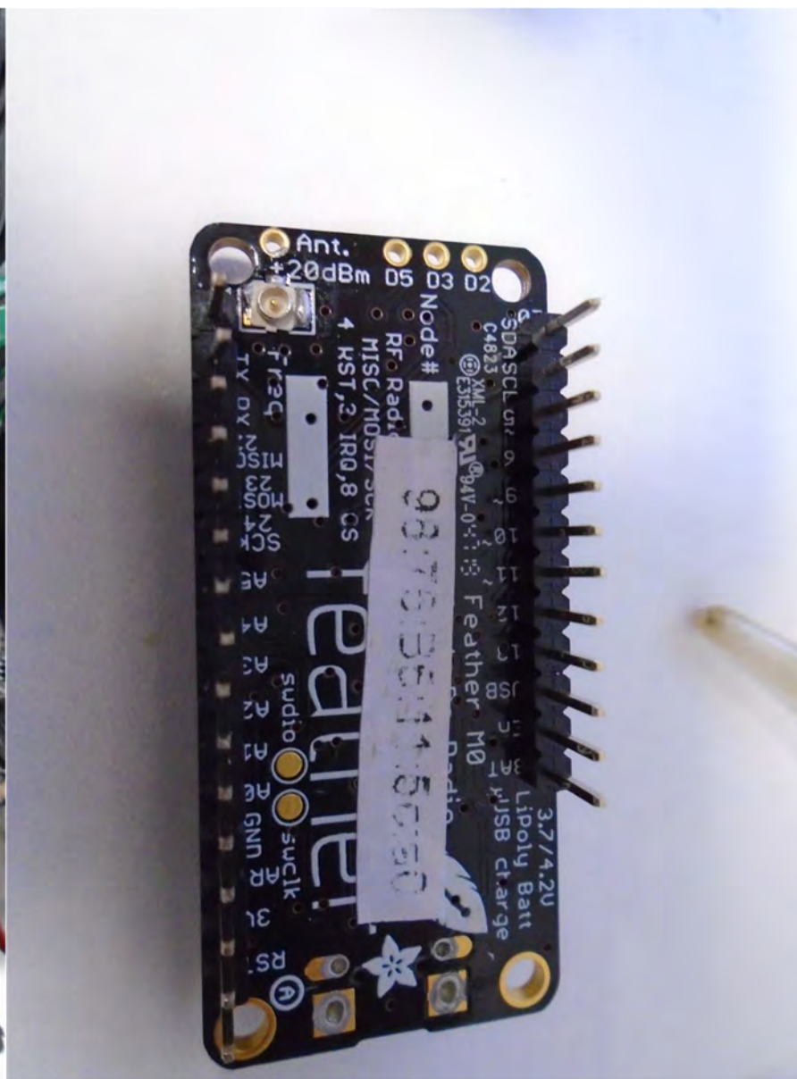
LORA RADIO BOARD