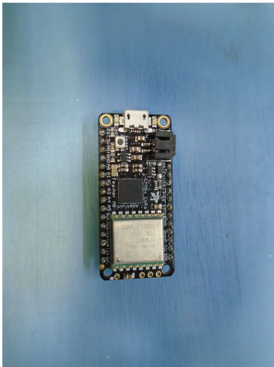
LORA RADIO BOARD