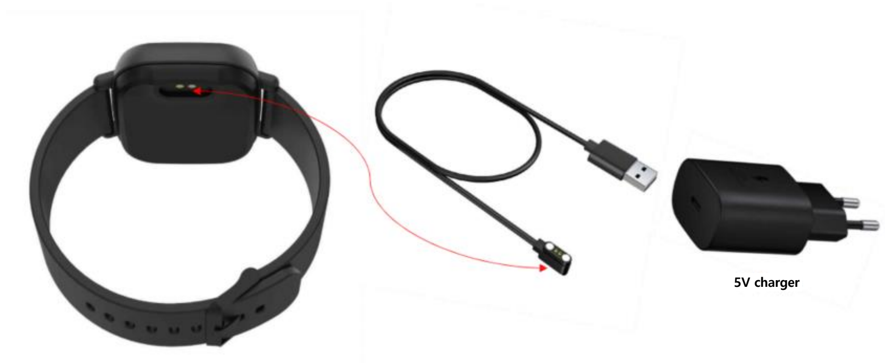
Connecting the main unit's charging terminal to the charging cable's charging terminal