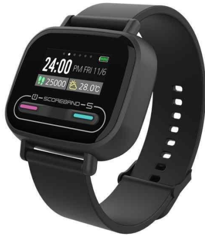
WEKKUK Smart Score Band