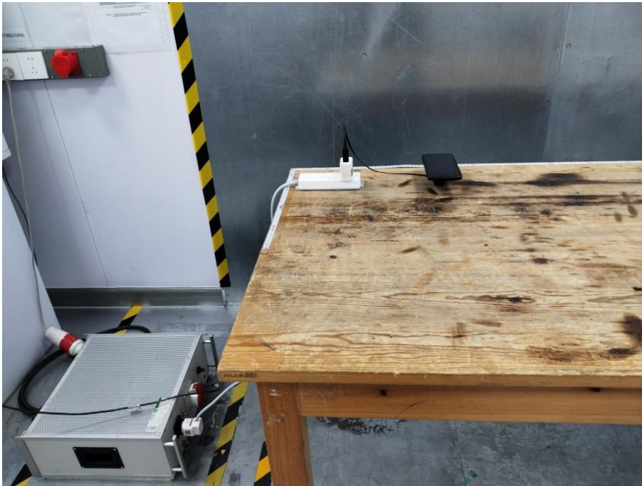
Emissions in frequency bands (below 30MHz)