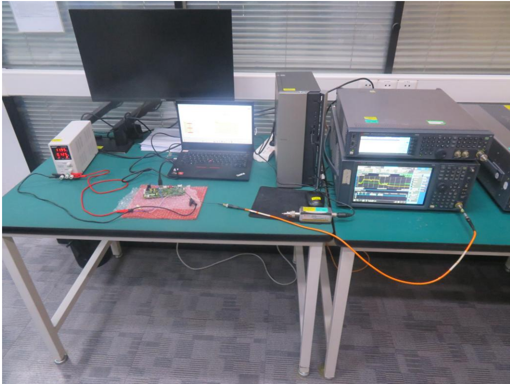
Description: Conducted Test Setup (For SRD)