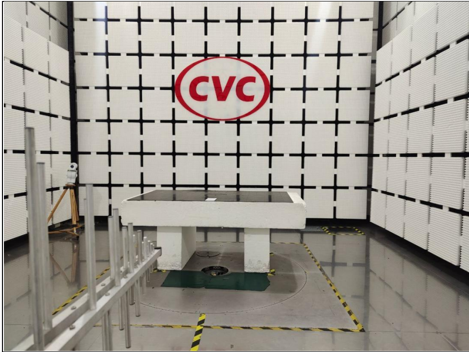
RADIATED EMISSION TEST BELOW 1GHz