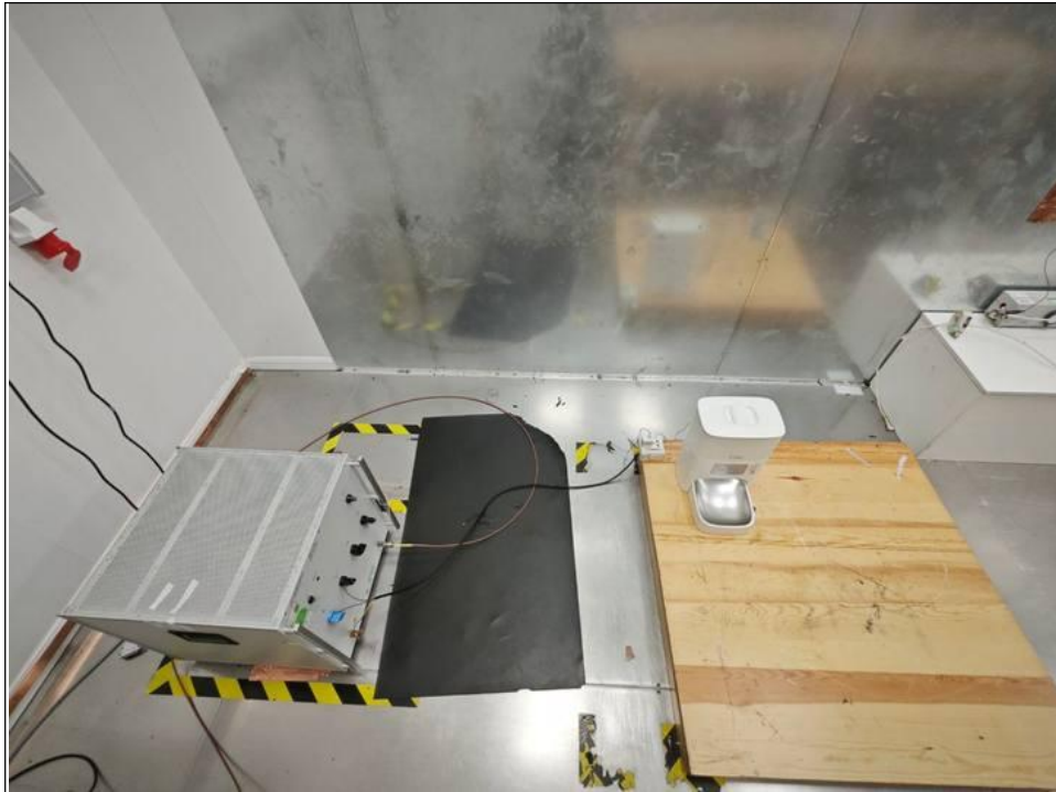
CONDUCTED EMISSION TEST