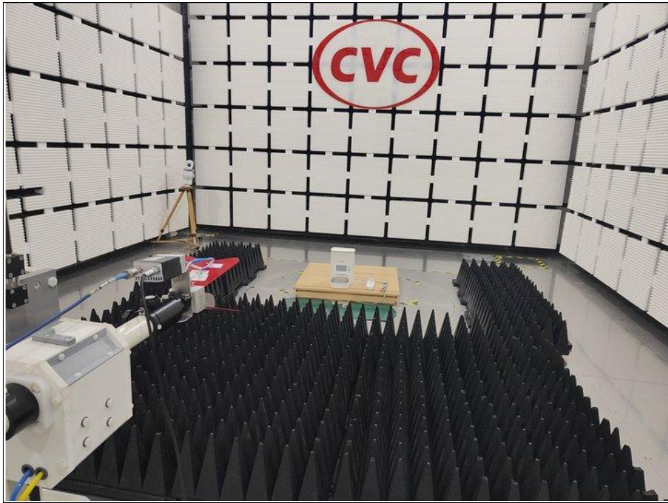
RADIATED EMISSION TEST (1GHz ~ 18GHz)