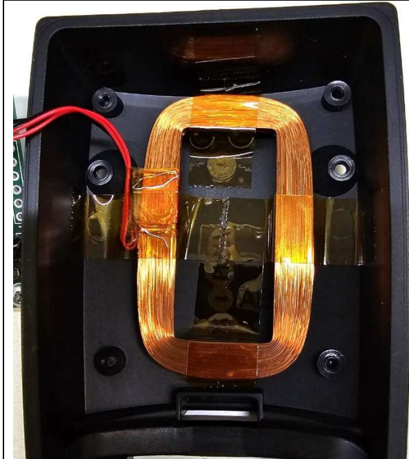
Patient Controller Internal Photo, Coil