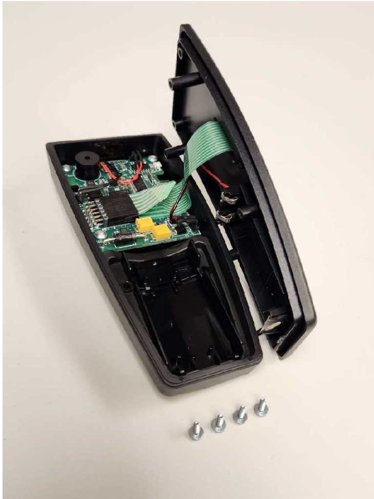
Patient Controller Internal Photo, Case Disassembled