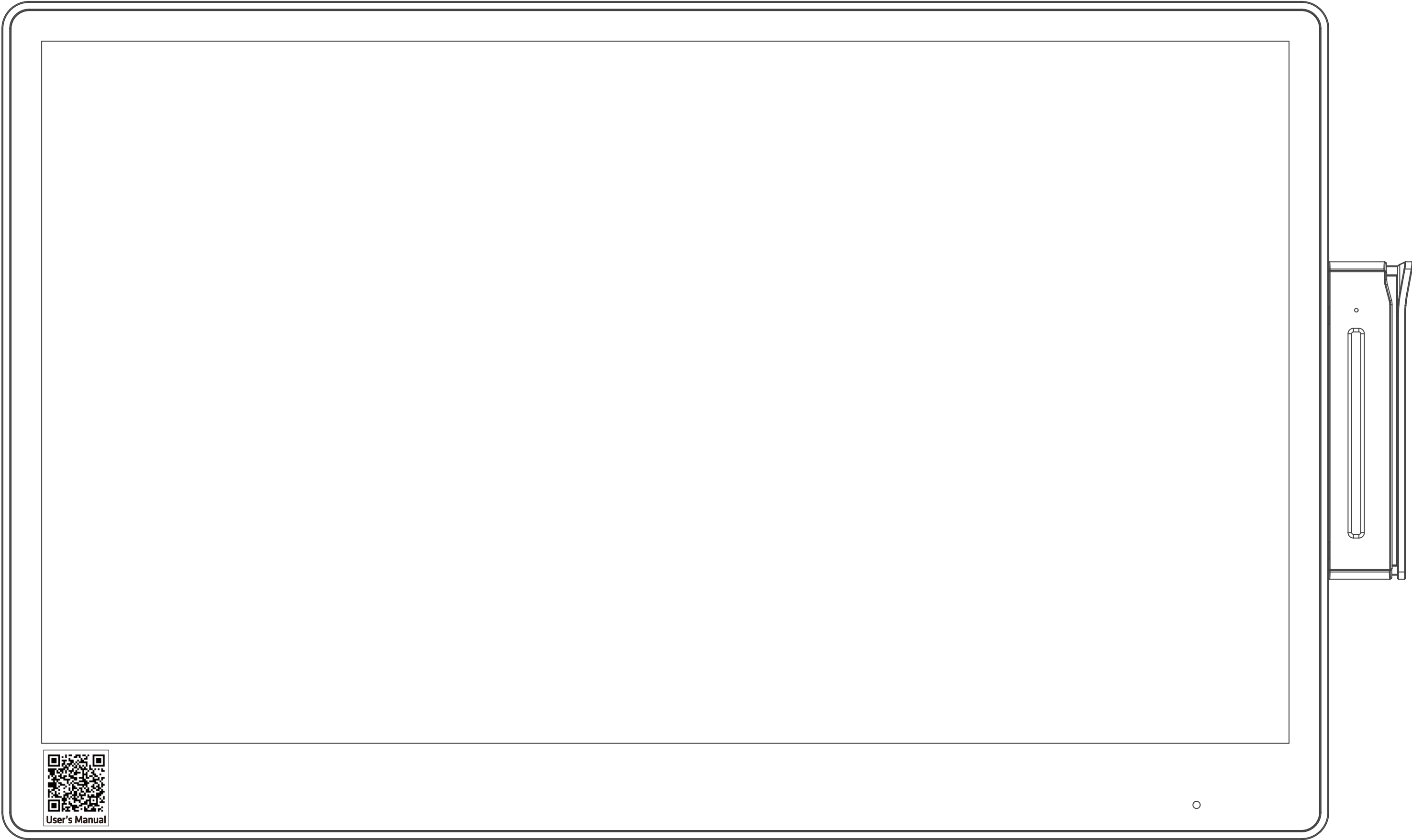
ACT QR Code Label 18*21 (mm) 투명 PET 인쇄색상 : White