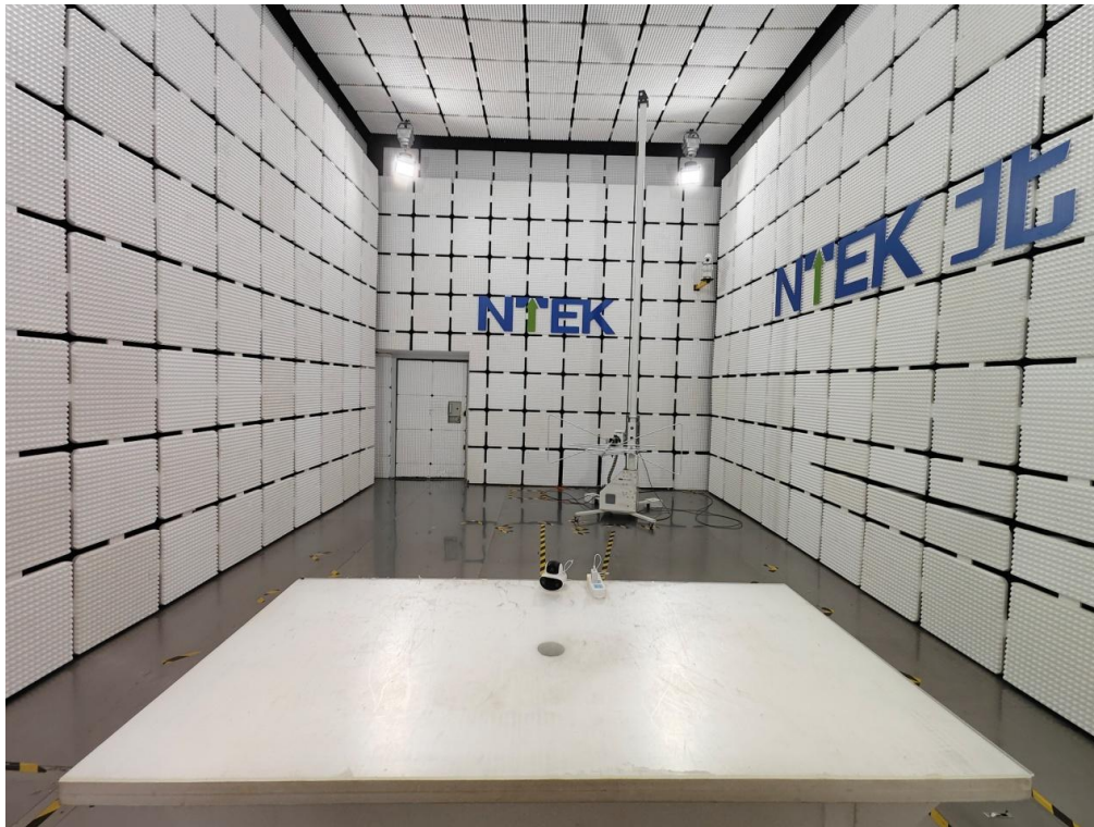
Radiated Measurement Photos