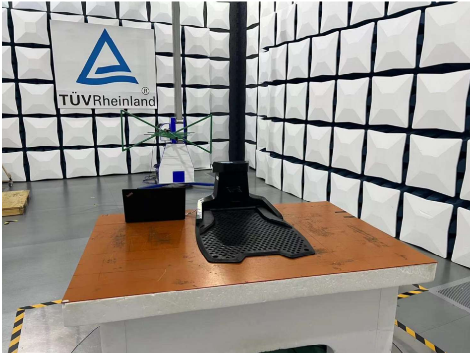
Test Set-up: Radiated spurious emission Below 1GHz