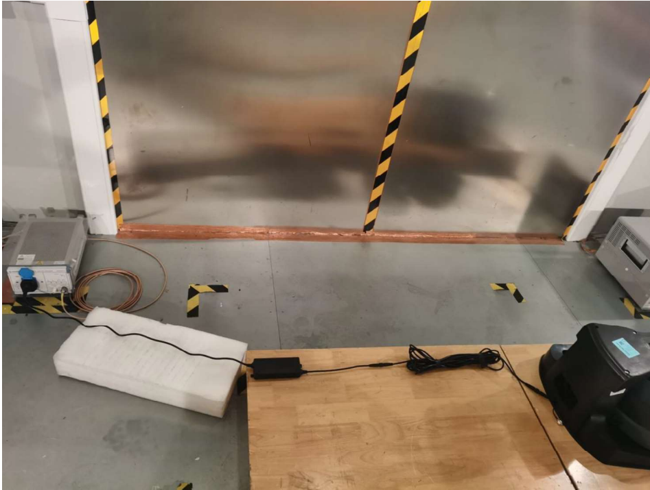
Test Set-up: Conducted emission 150KHz-30MHz