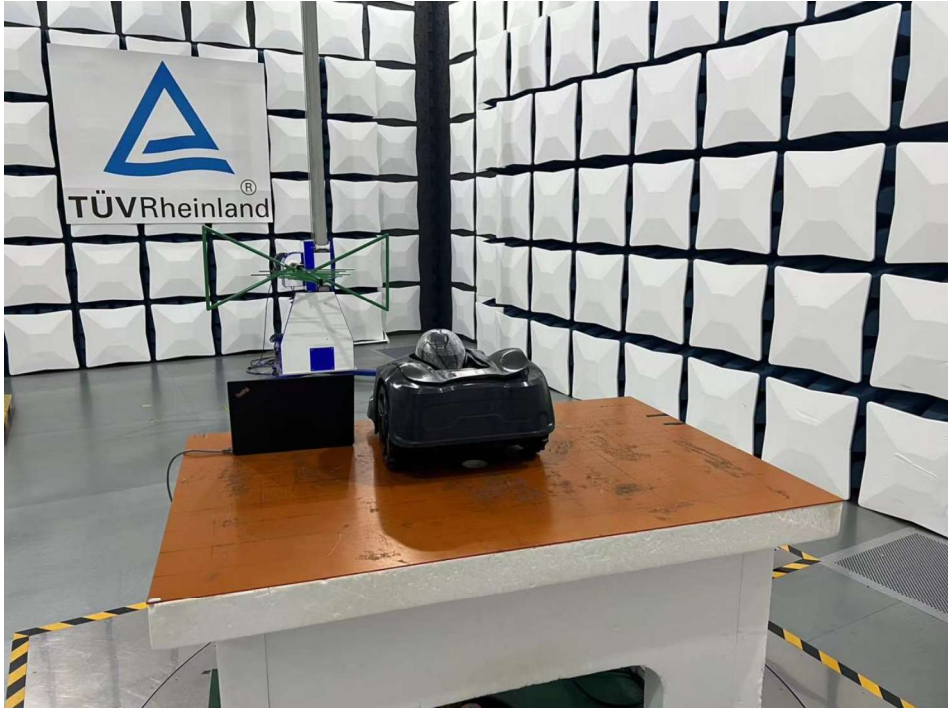
Test Set-up: Radiated spurious emission Below 1GHz