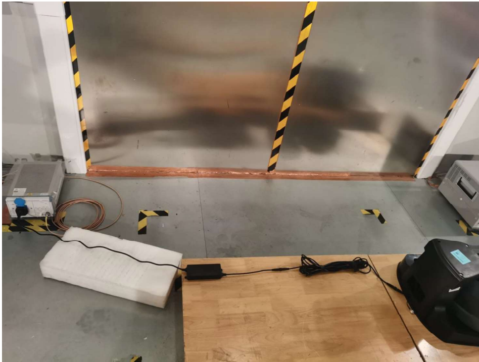
Test Set-up: Conducted emission 150KHz-30MHz