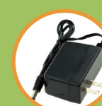
Power adapter (varies by region)