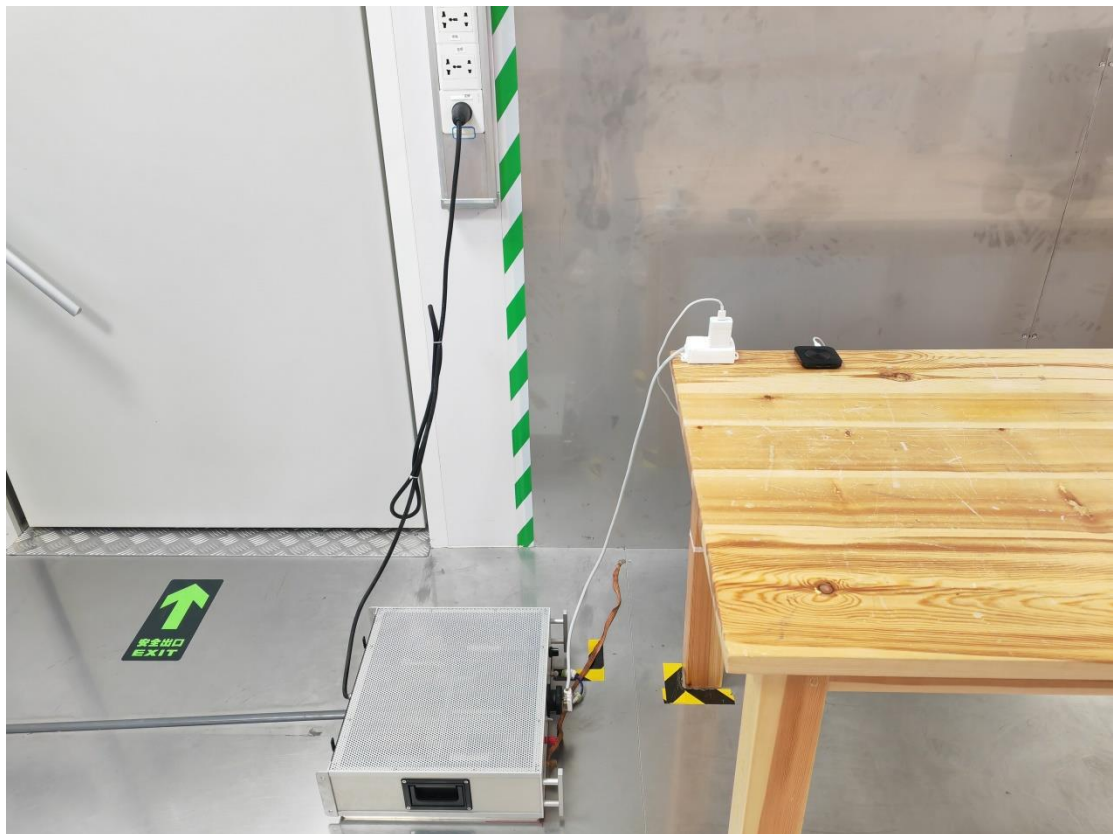
Emissions in restricted frequency bands (below 1GHz)