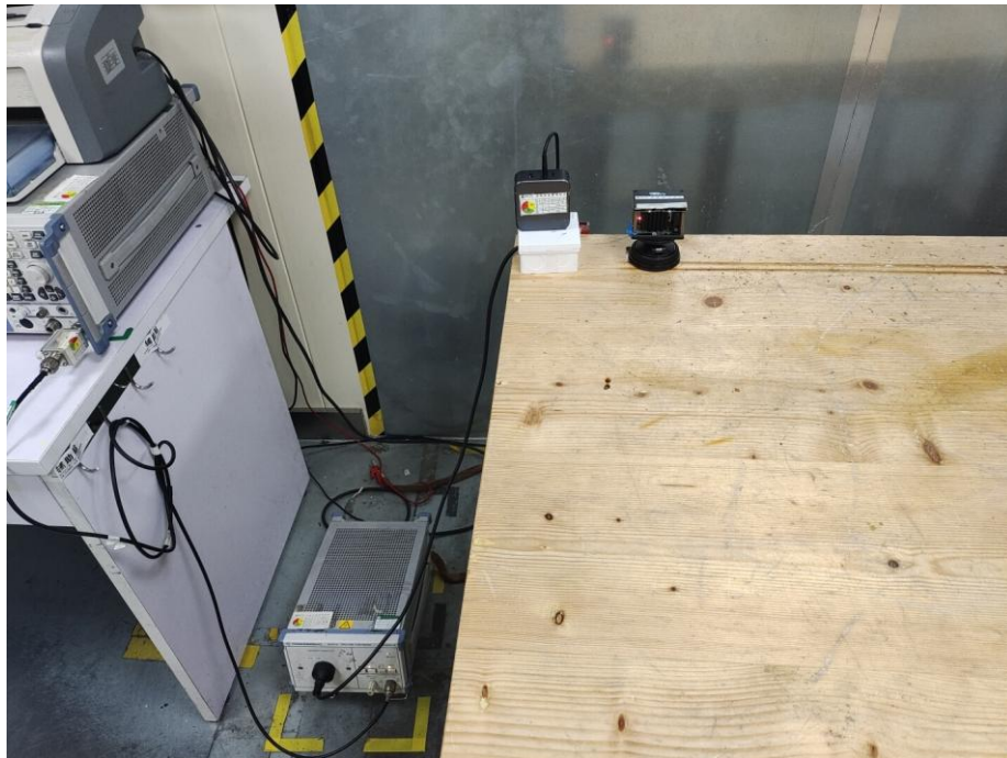
Conducted Emissions Photo