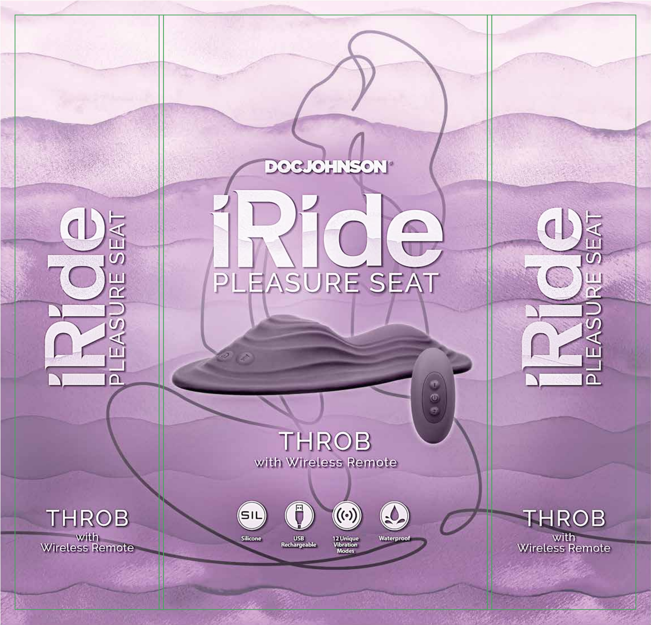
Box Cover: Outer