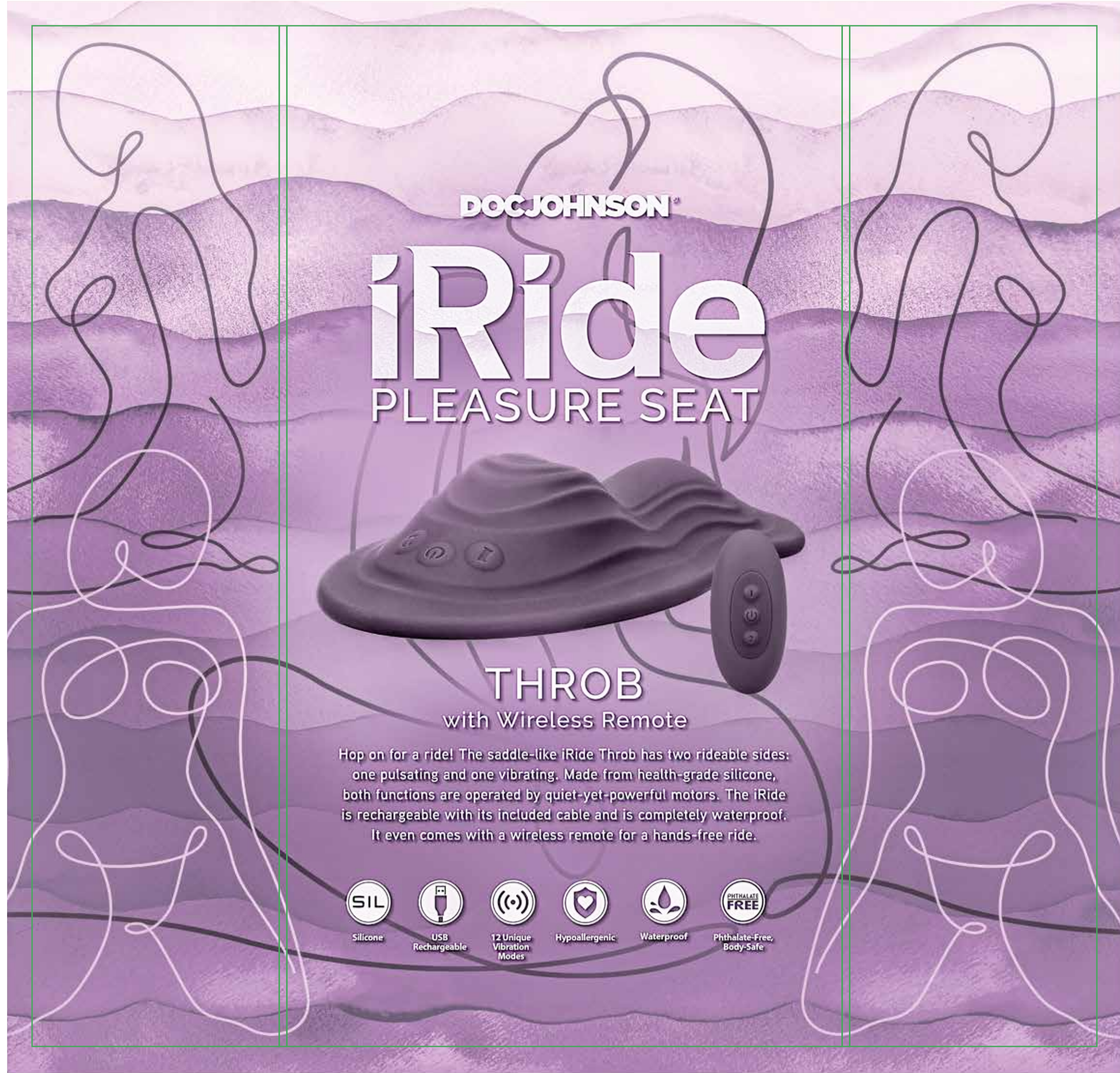
Box Cover: Inner