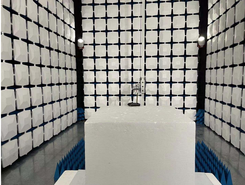
Above 1GHz for radiated emission test setup