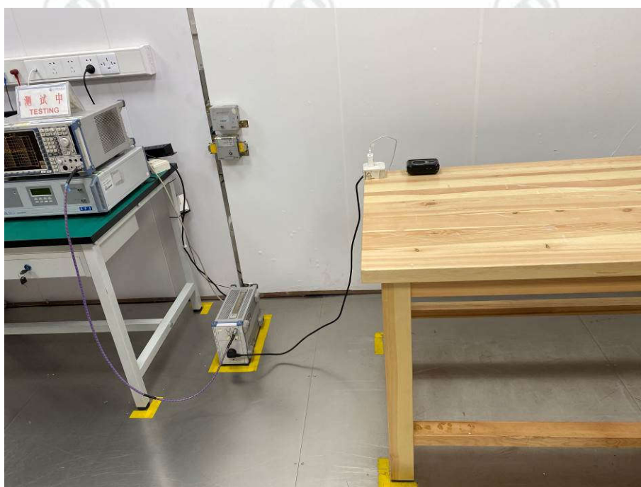
Radiated spurious emission Test Setup-2(CE)