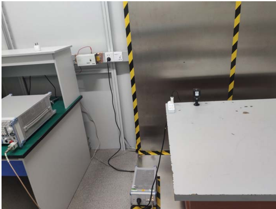
RF Conducted Emission