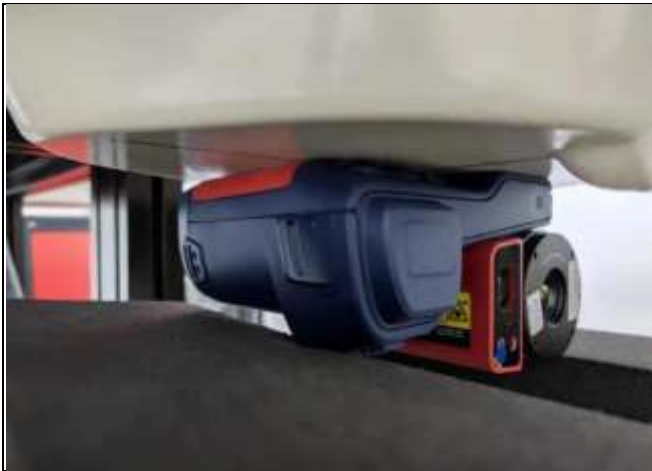
Figure 1.1-1 Front side 0mm

According to the antenna position, the Body SAR is tested at the following 8 test positions all with the distance =0mm between the EUT and the phantom bottom: