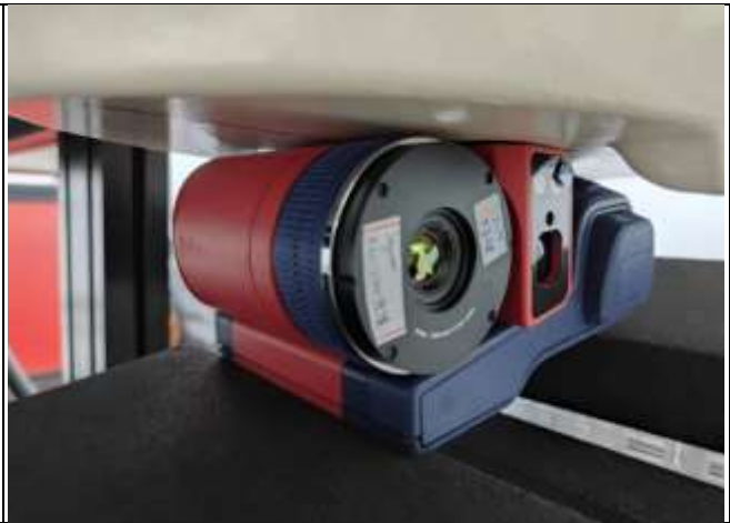
Figure 1.1-2 Back side 0mm