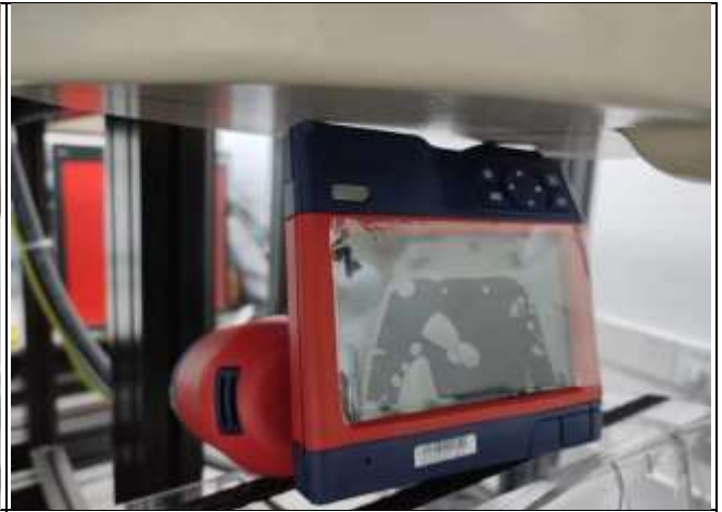
Figure 1.1-8 Top side 0mm-open