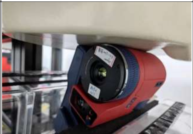
Figure 1.1-4 Left side 0mm