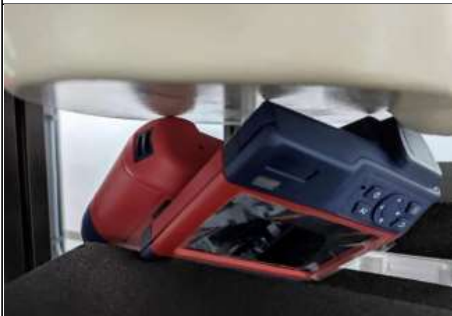
Figure 1.1-3 Back side 0mm-open