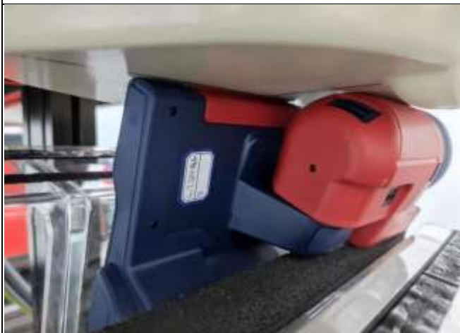
Figure 1.1-5 Left side 0mm-open