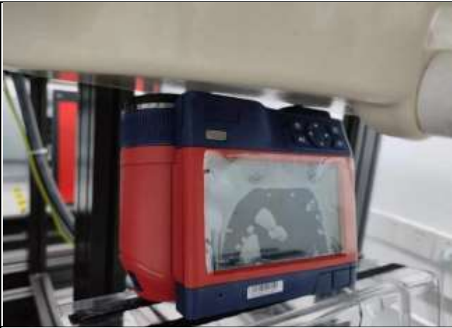
Figure 1.1-7 Top side 0mm