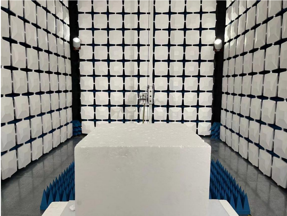
Below 1GHz for radiated emission test setup