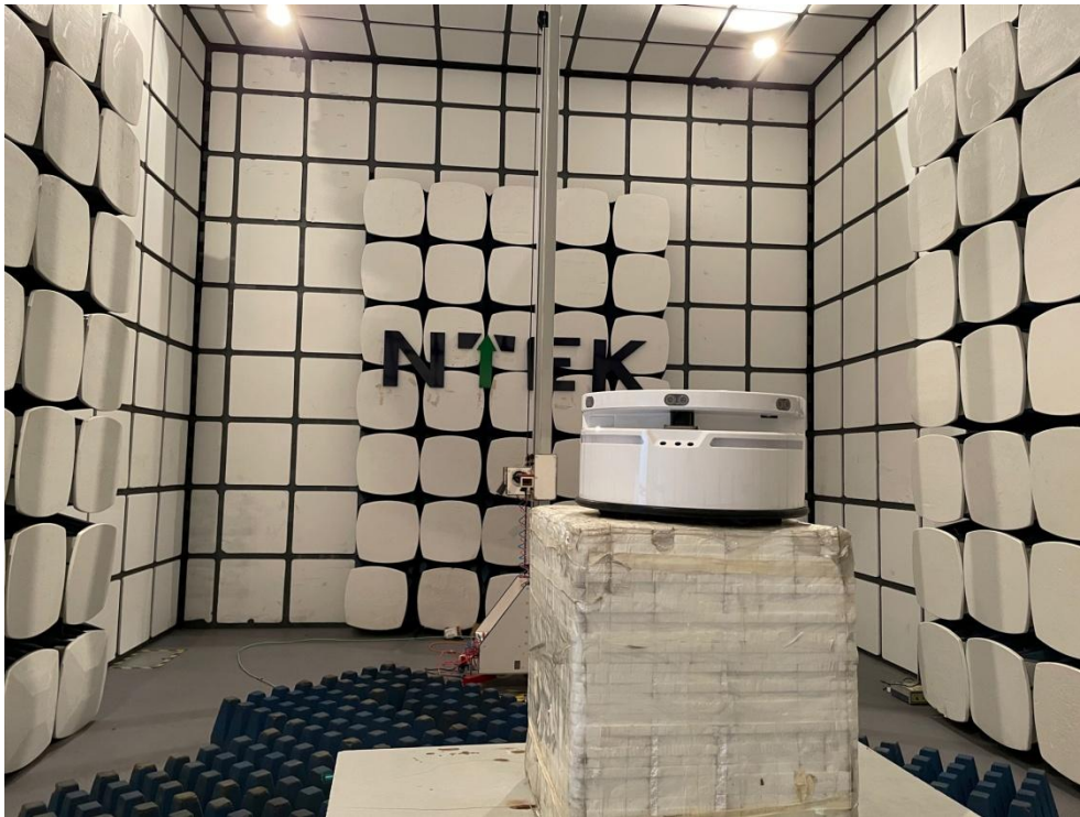
AC Conducted Measurement Photos