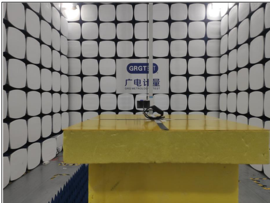
1GHz to 18GHz