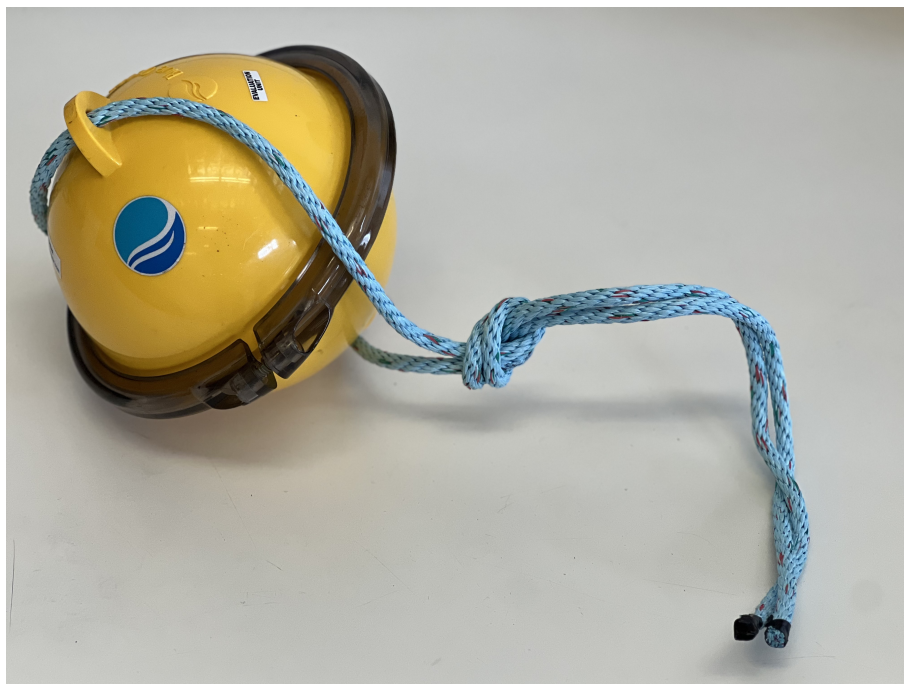
Figure 2: Correct Knot Placement