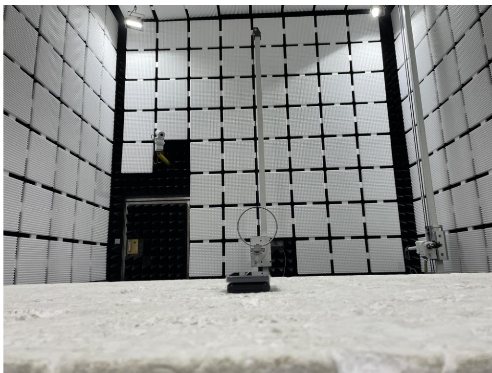
Radiated Emission below 30MHz