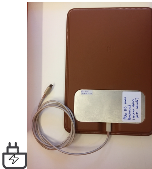
Back of product

Use USB-C cable to connect to a power adapter (not included)