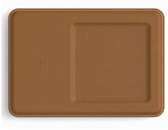
H: inductive part