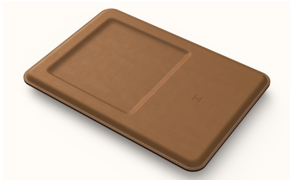
Front of product

As part of our common efforts to reach our environmental goals, Wireless Charging Change Tray Volt'H does not include a power adapter. Please use your existing power adapter.