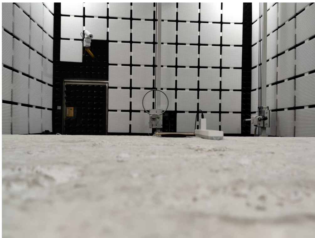
Radiated Emission below 30MHz