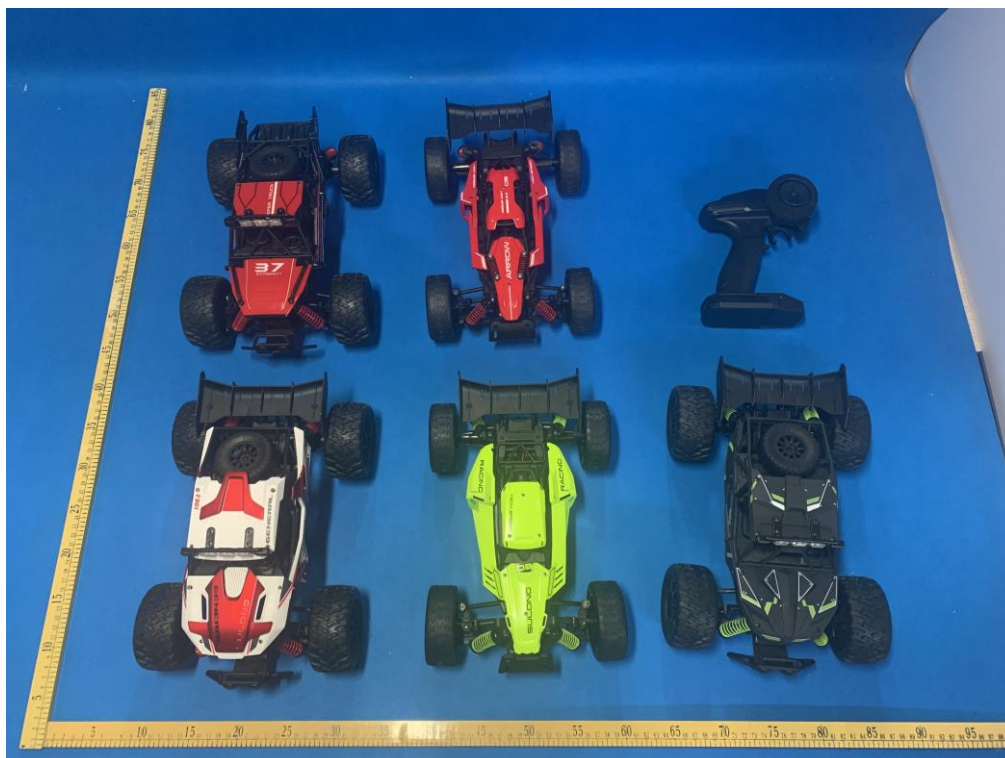
All VIEW-12 OF EUT