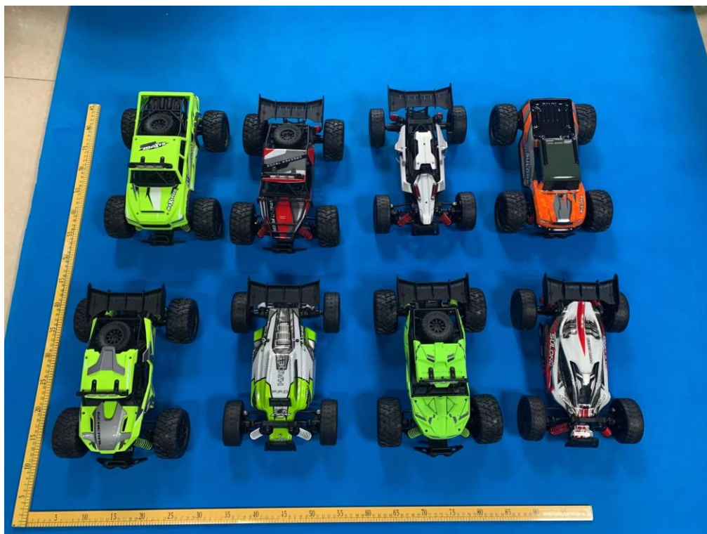
All VIEW-6 OF EUT