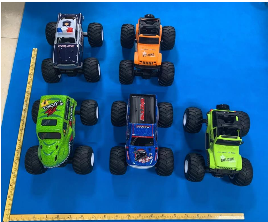
All VIEW-10 OF EUT