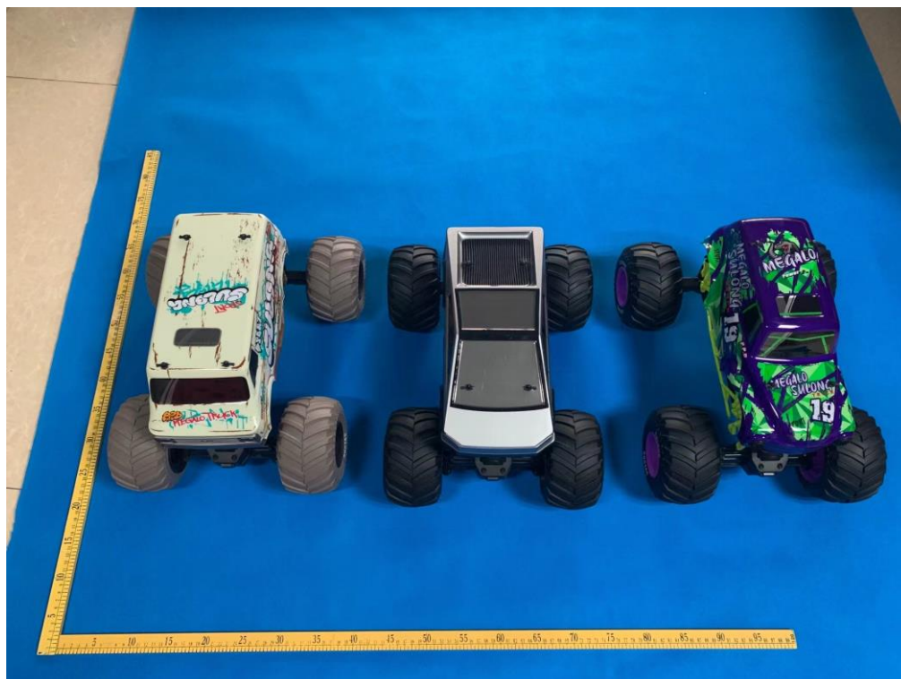
All VIEW-4 OF EUT