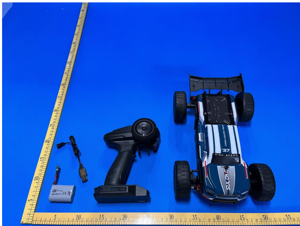
All VIEW-14 OF EUT