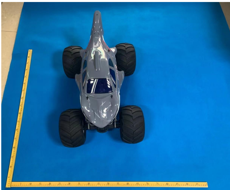
All VIEW-8 OF EUT