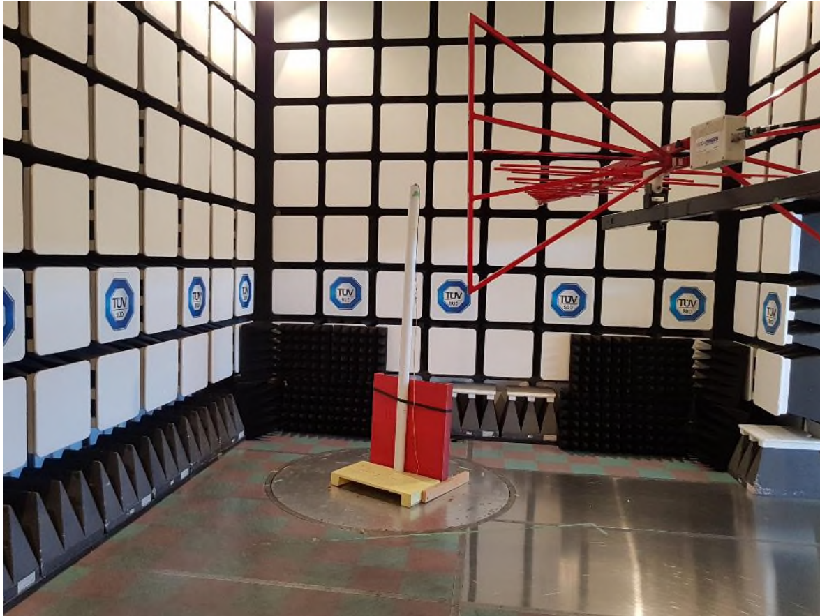
Figure 2 – Radiated Emissions Setup – Photo 2 30MHz – 1GHz