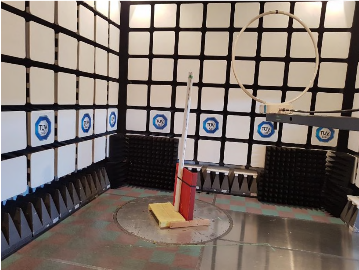
Figure 1 – Radiated Emissions Setup – Photo 1 9kHz – 30MHz