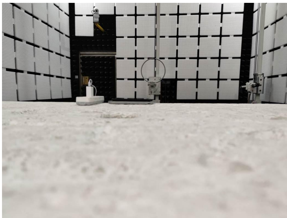
Radiated Emission below 30MHz-AC adapter charge mode