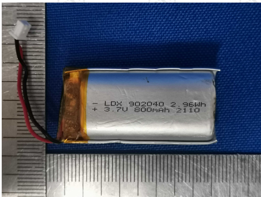
View of Product-10