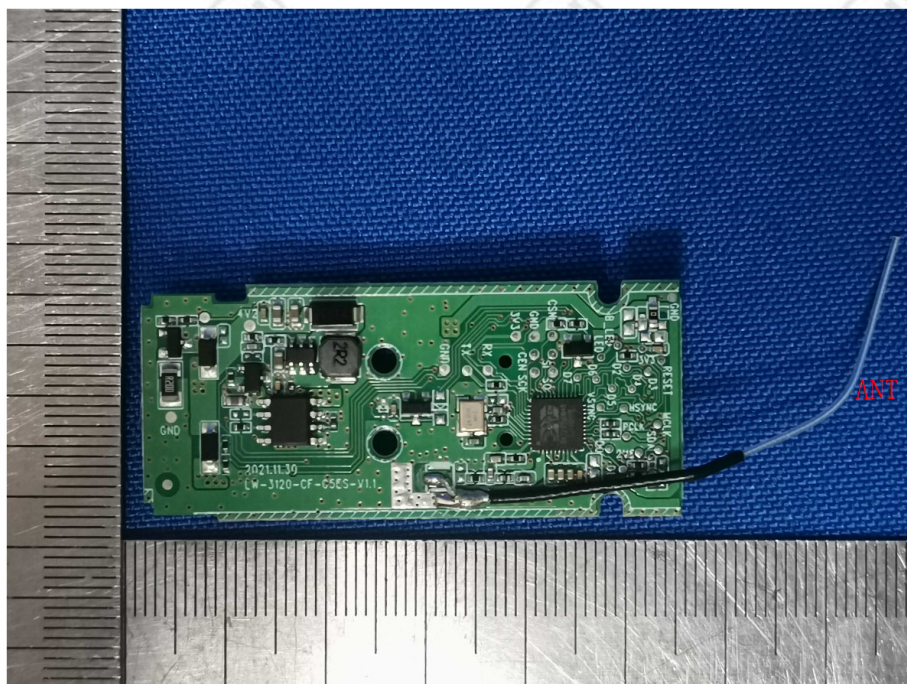
View of Product-11