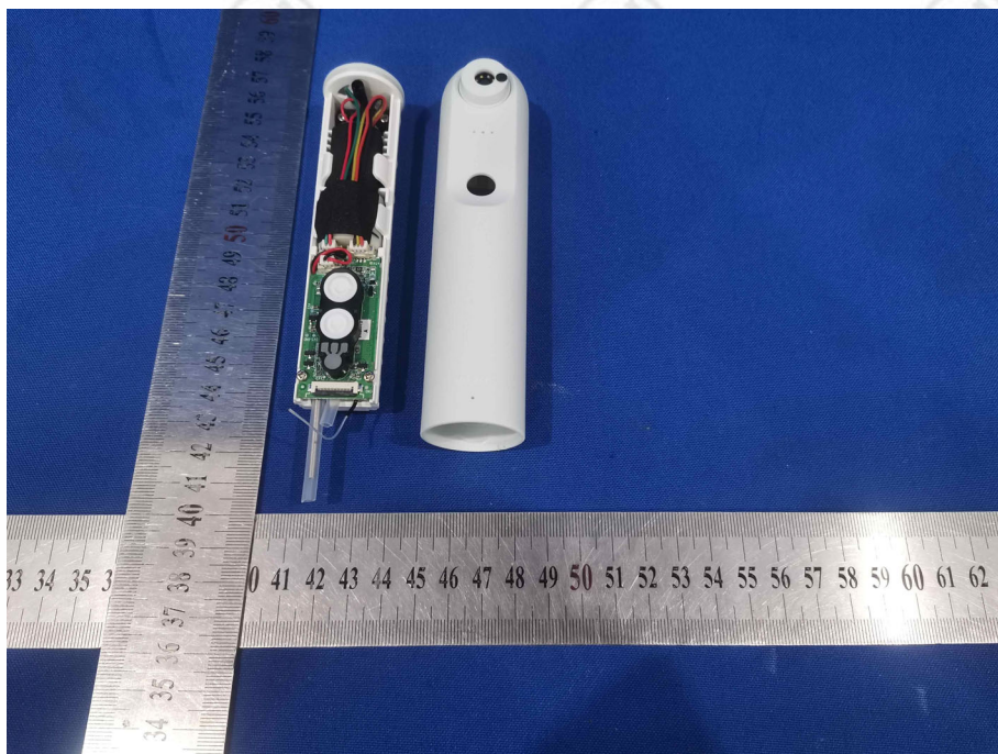
View of Product-9