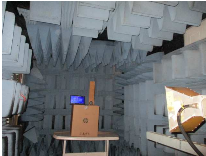
Figure 5. Radiated Emission Test, 1-18GHz