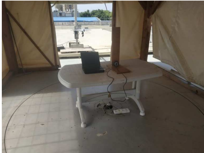
Figure 4. Radiated Emission Test, 200-1000MHz