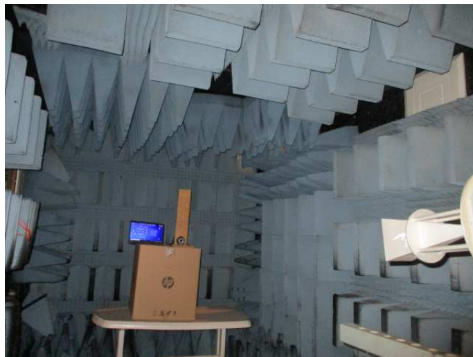
Figure 6. Radiated Emission Test, 18-25GHz