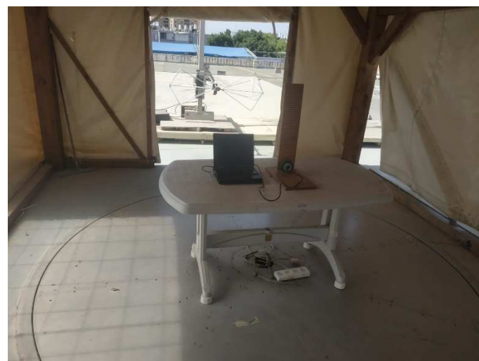
Figure 3. Radiated Emission Test, 30-200MHz